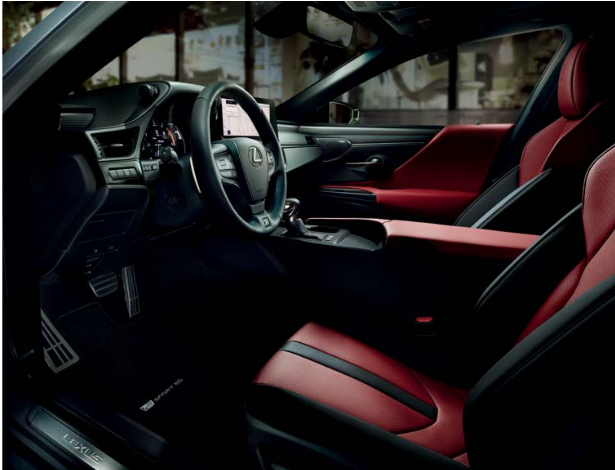
ES F SPORT Handling shown with Circuit Red NuLuxe® and Hadori Aluminum interior trim