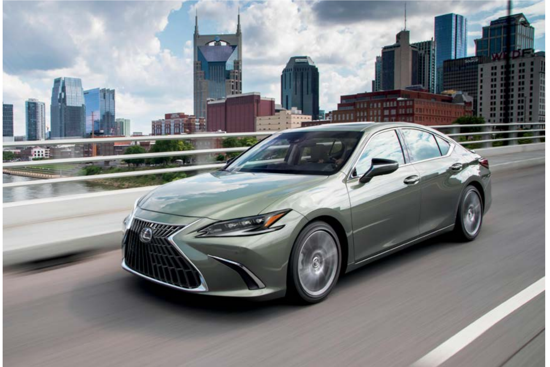
ESh shown in Sunlit Green

Combining next-generation hybrid technology and a highly potent 2.5-liter engine, this is the best of everything the ES has to offer. Its battery is not only remarkably small and lightweight, but also strategically placed as close to the middle of the vehicle as possible for optimized front/rear weight distribution and a lower center of gravity. And with paddle shifters that deliver driving dynamics similar to the ES 250 AWD and ES 350, the ES Hybrid and ES Hybrid F SPORT models bring you closer to the road than ever before. Pairing powerful performance with a 44-MPG combined estimate, 2 it isn't just the most fuel-efficient Lexus sedan ever—it's the most fuel-efficient among all non-plug-in luxury vehicles, 1 period.