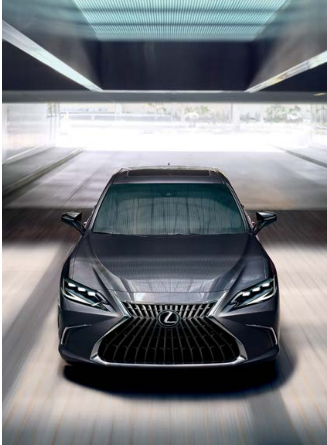
ES shown in Cloudburst Gray 9