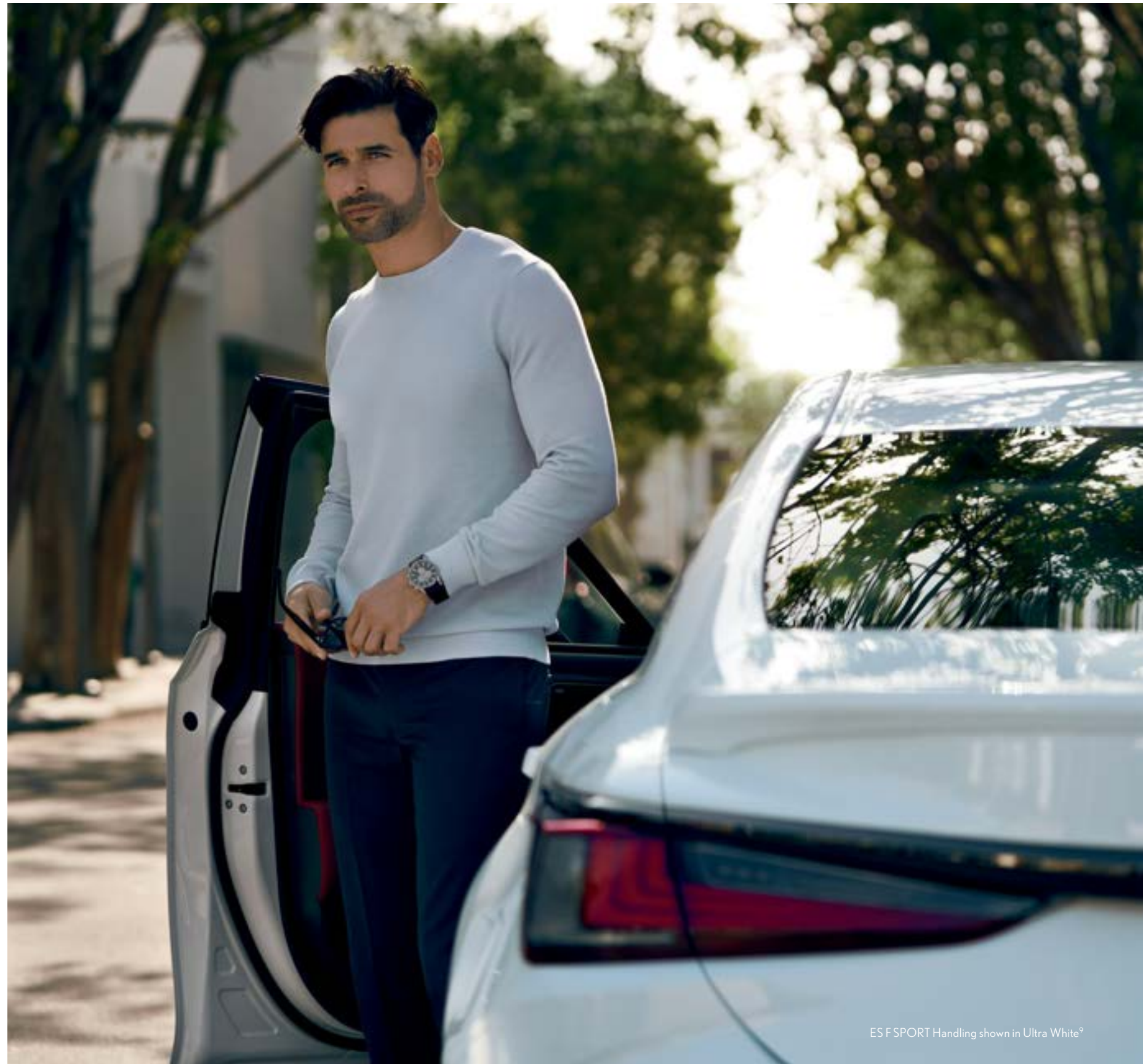
ES F SPORT Handling shown in Ultra White 9