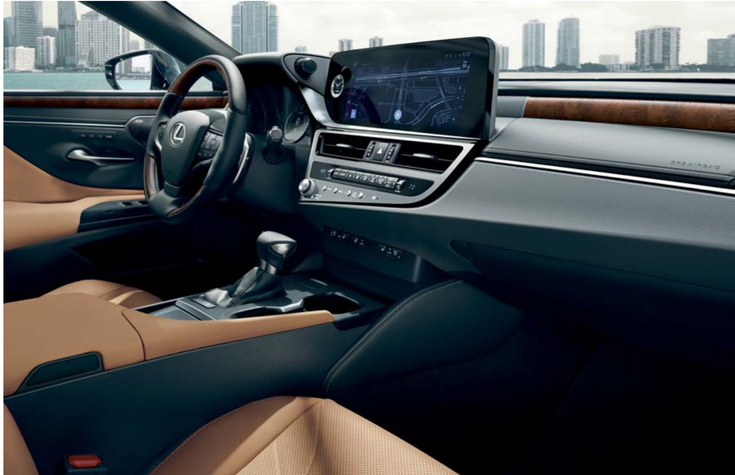
ESh shown with Palomino semi-aniline leather and Open-Pore Brown Walnut interior trim

With contemporary styling and cutting-edge technology, the ES offers a refreshing point of view on modern luxury. Discover thoughtful amenities like 10-way power-adjustable seats with available heating and ventilation, designed to envelop you and connect you to the road. Unlike conventional ventilated seats, these pull air directly from the climate-control system to more effectively and efficiently cool you. These refined luxuries are complemented by numerous expressions of modern style and technology—from an intuitively positioned available 12.3-inch touchscreen display to available ambient lighting that accentuates the sculpted lines throughout the cabin.