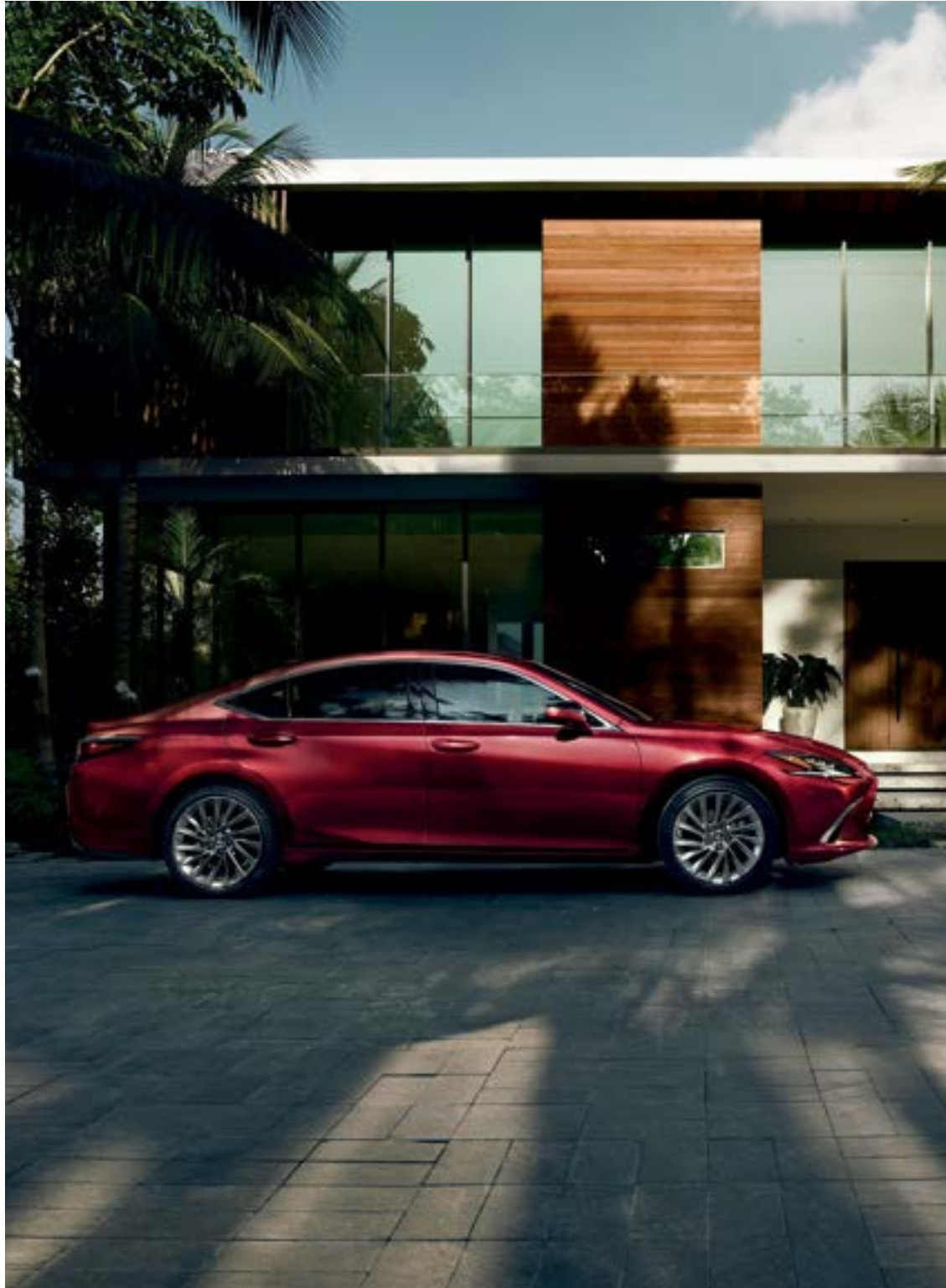
ES shown in Matador Red Mica