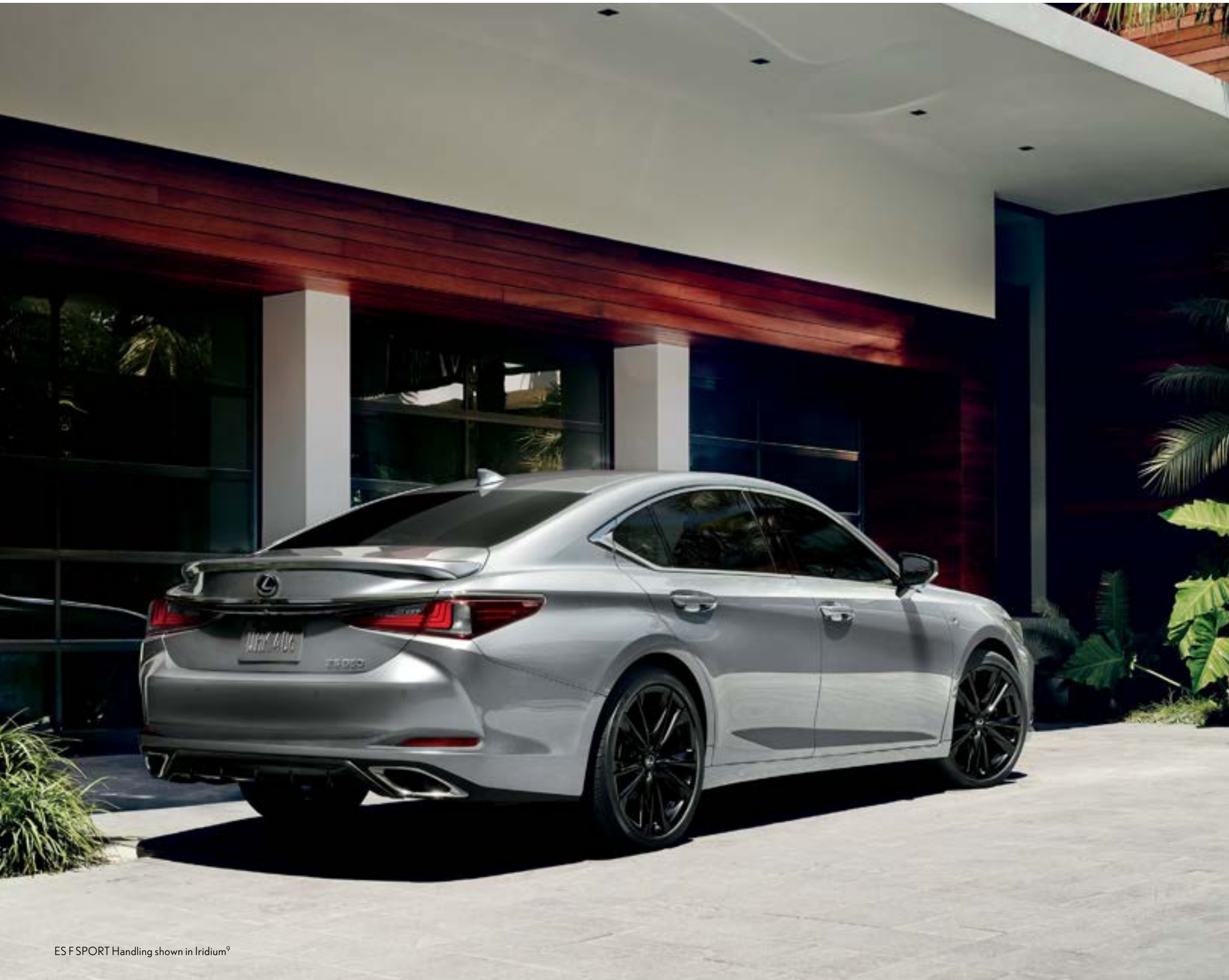
ES SPORT Handling shown in Iridium 9