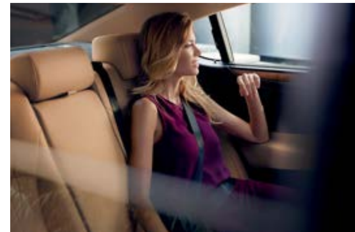
ESh shown with Apple CarPlay 7 integration and Palomino semi-aniline leather interior trim

Featuring Lexus Interface 6 and innovations including wireless Apple CarPlay compatibility and available class-exclusive audio technology, 4 the ES helps keep you more connected than ever before.