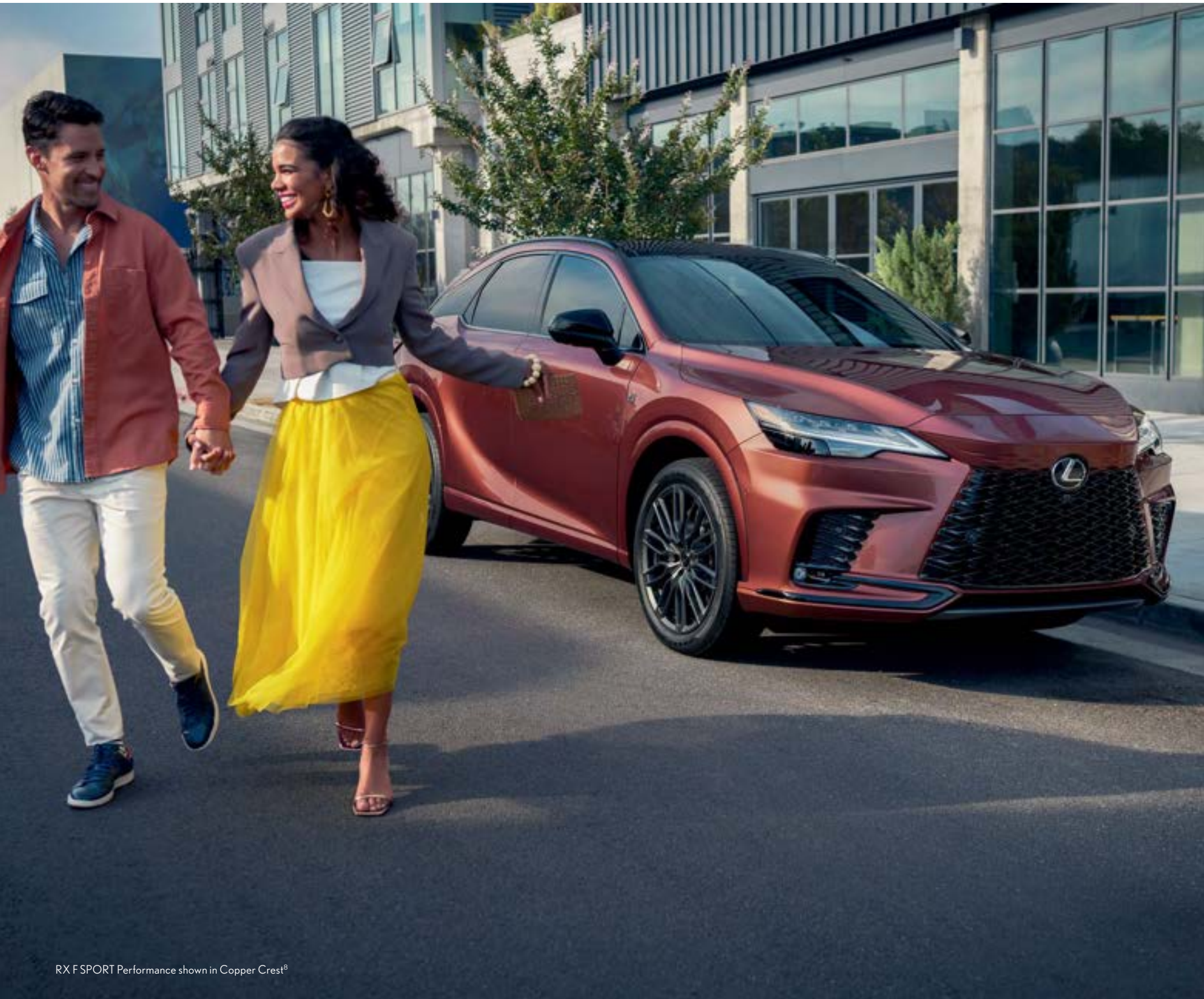
RX F SPORT Performance shown in Copper Crest®