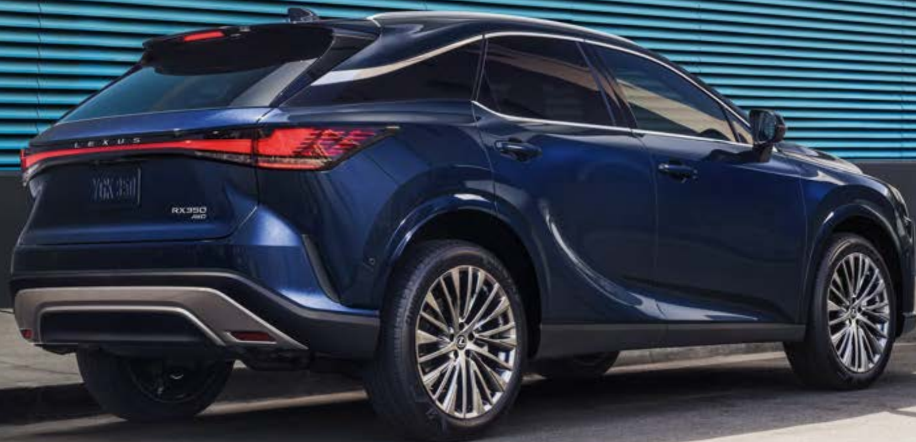
RX Luxury AWD shown in Nightfall Mica