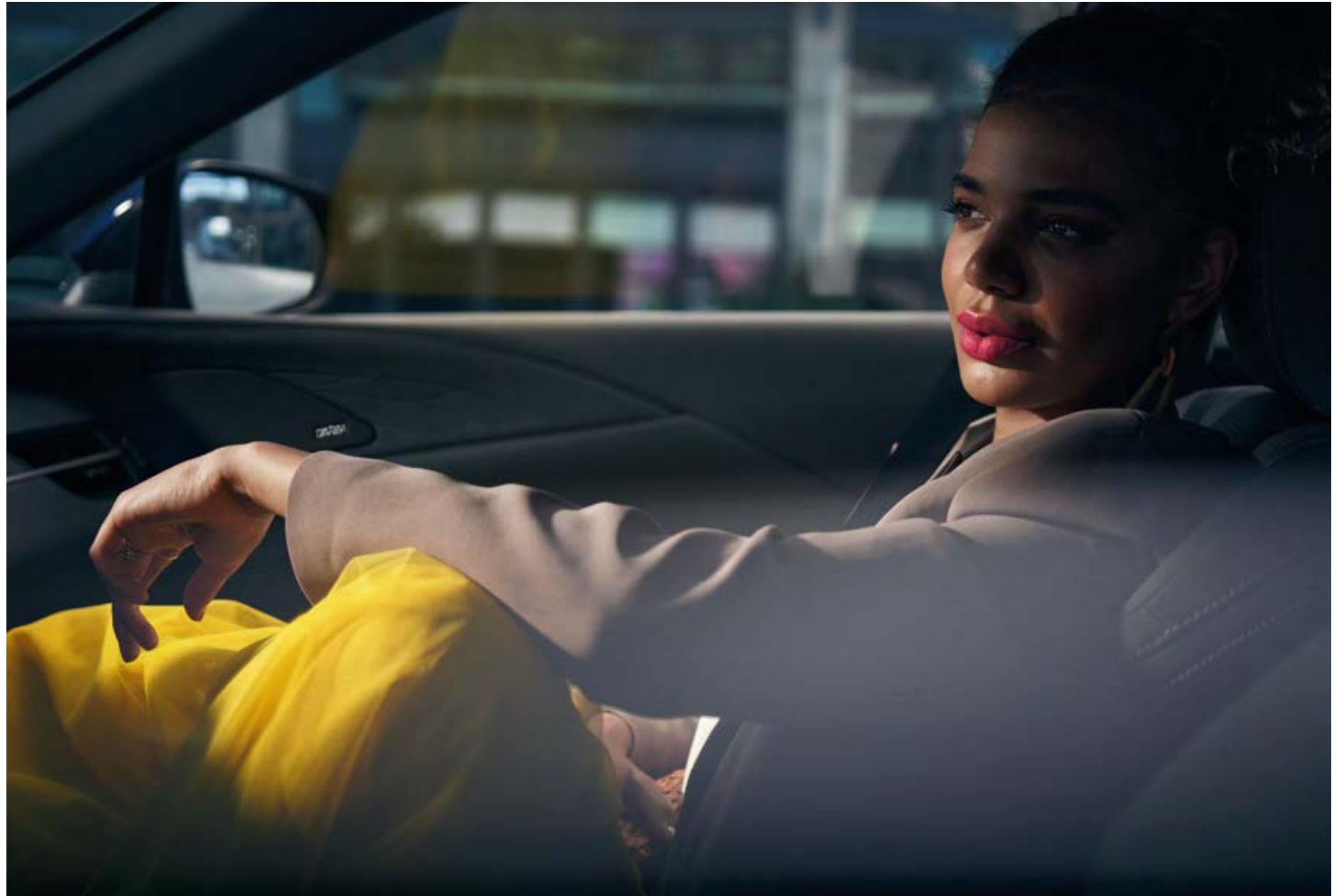
RX Luxury shown with Black semi-aniline leather and Black Open-Pore Wood interior trim