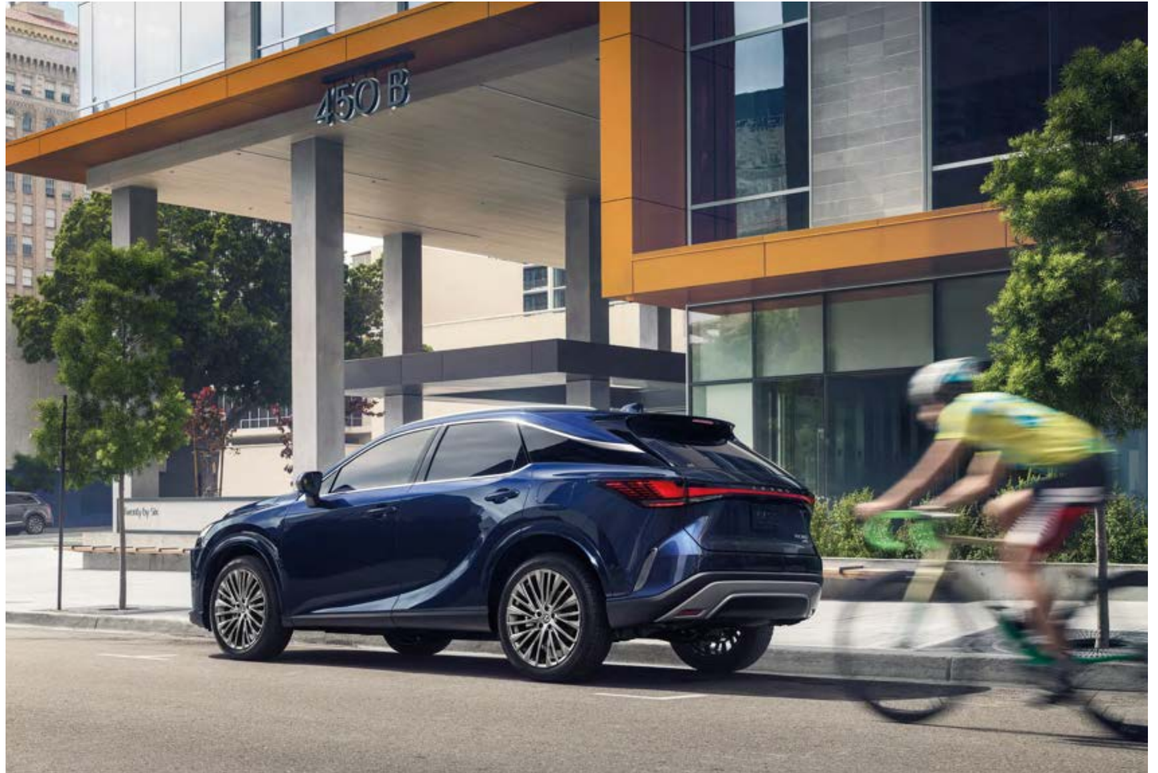
RX Luxury AWD shown in Nightfall Mica

Like cruise control for when highway traffic isn't cruising. With an active Drive Connect 3 trial or subscription, this available technology 19 can monitor surrounding traffic in condensed, low-speed driving situations and automatically move forward and brake as needed to keep a set following distance behind the preceding vehicle. In addition to providing hands-free steering assistance, this system can automatically bring the vehicle to a complete stop, then resume its path of travel as forward traffic begins to move.