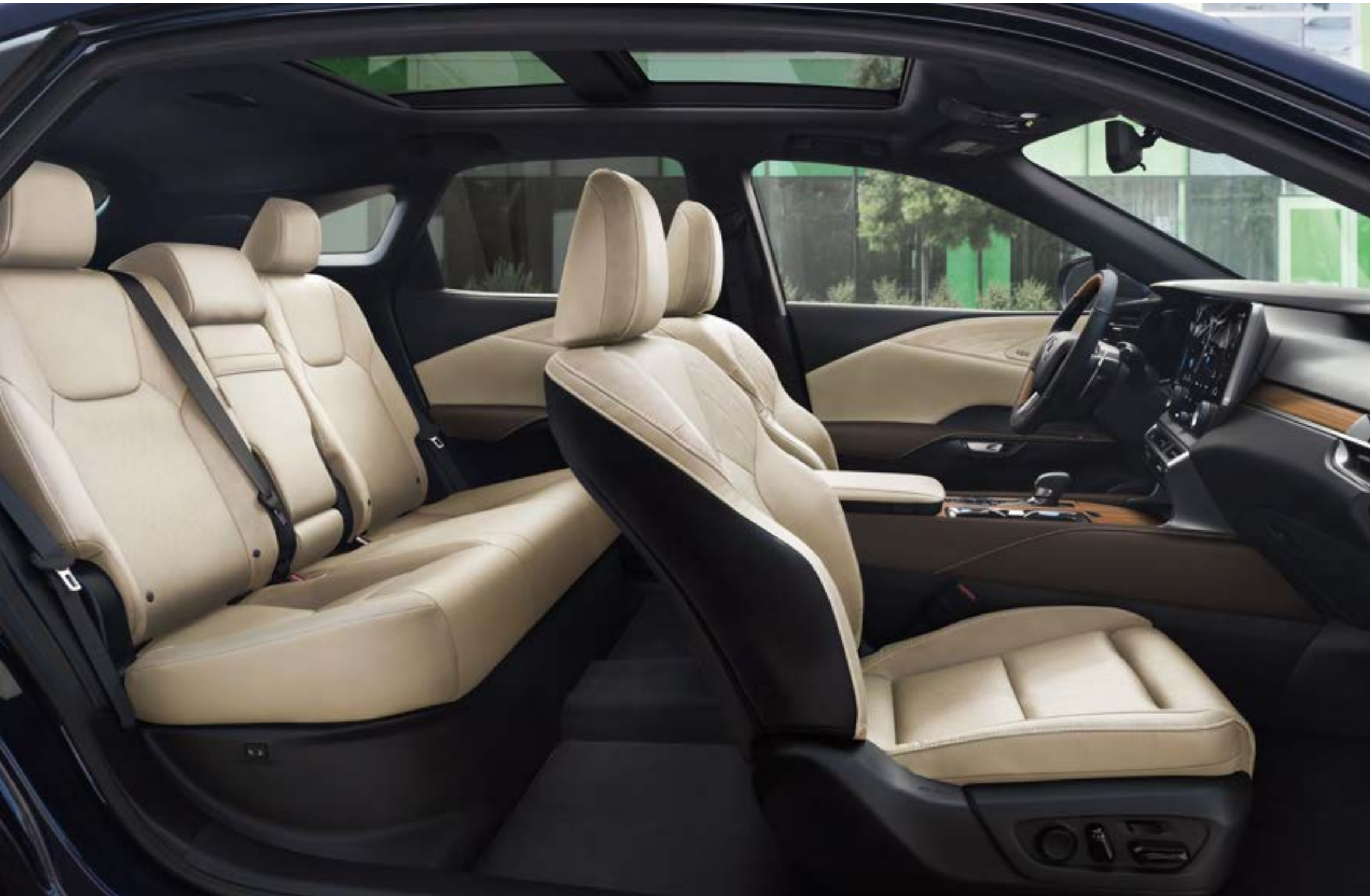
RX Luxury shown with Macadamia semi-aniline leather and Ash Bamboo interior trim