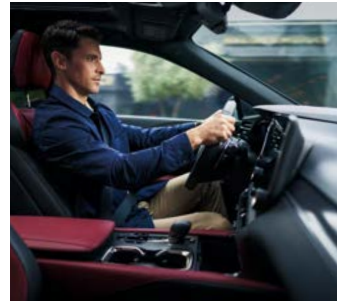
RX F SPORT Performance shown in Copper Crest ®

The all-new RX is engineered to turn corners and overturn convention, so you can forge a deeper connection with your drive.