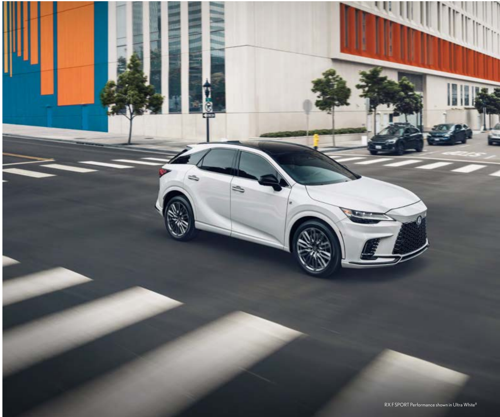
RX F SPORT Performance shown in Ultra White ®