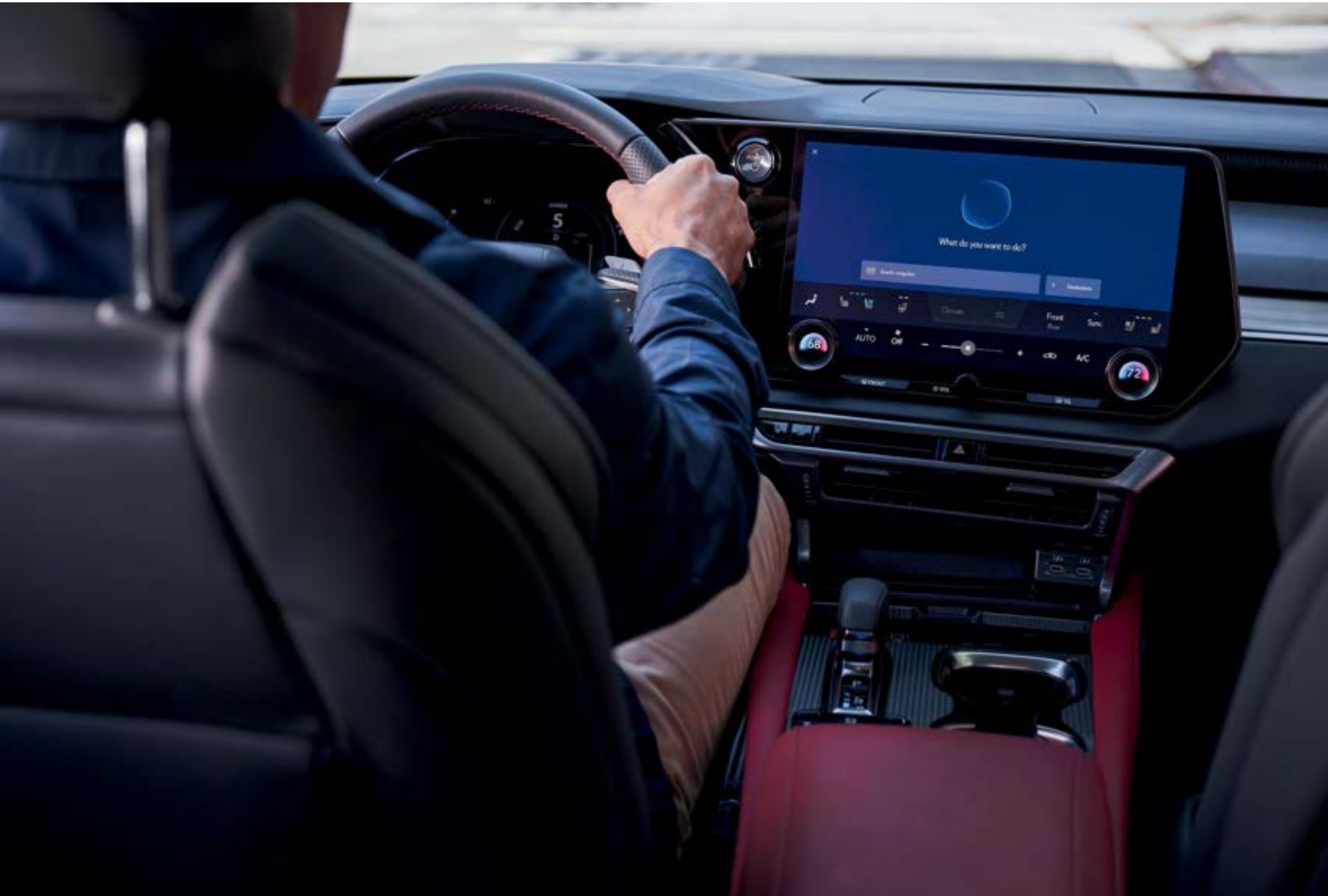
RX F SPORT Performance shown with 14-inch touchscreen display and Rioja Red leather and Dark Graphite Aluminum interior trim