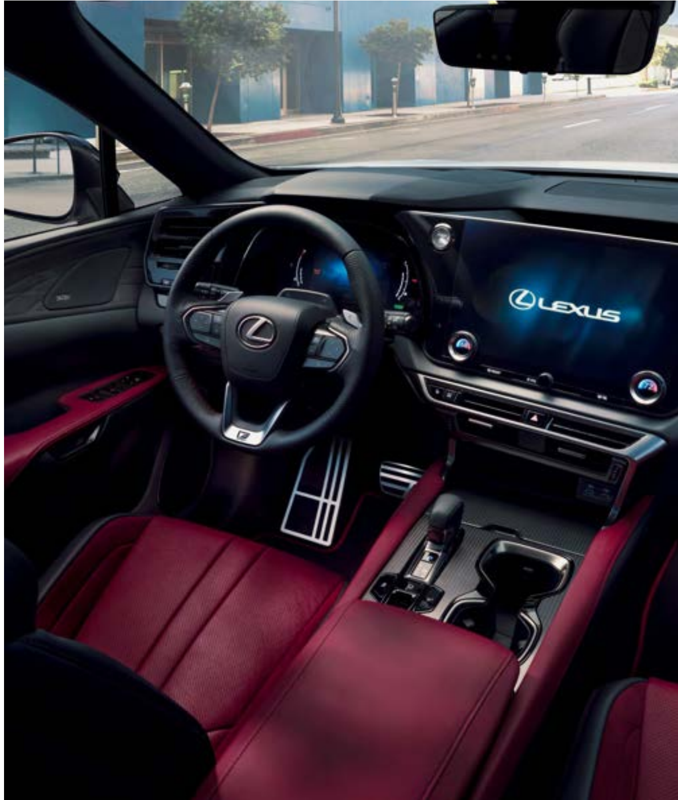
RX F SPORT Performance shown with Rioja Red leather and Dark Graphite Aluminum interior trim