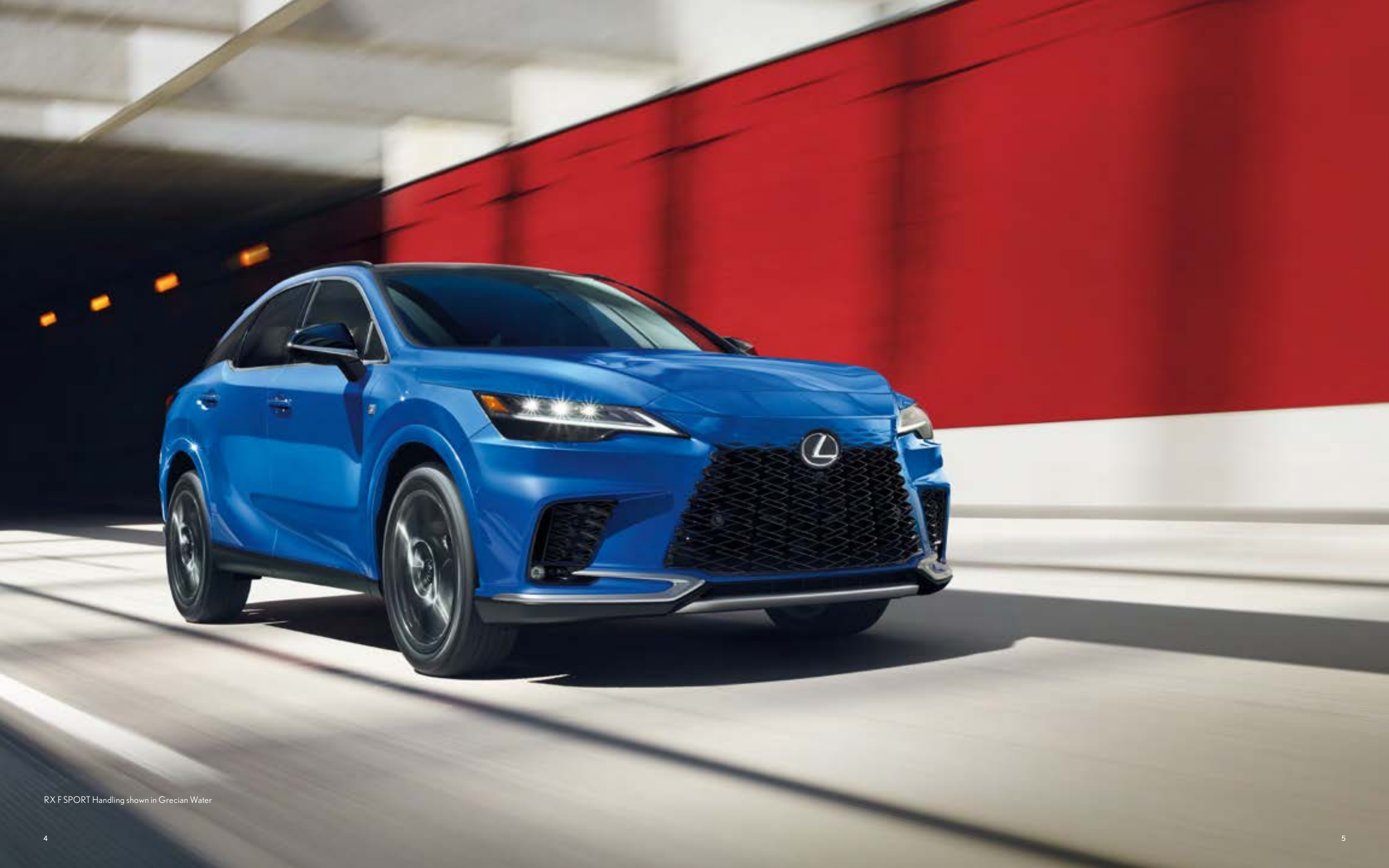
RX F SPORT Handling shown in Grecian Water