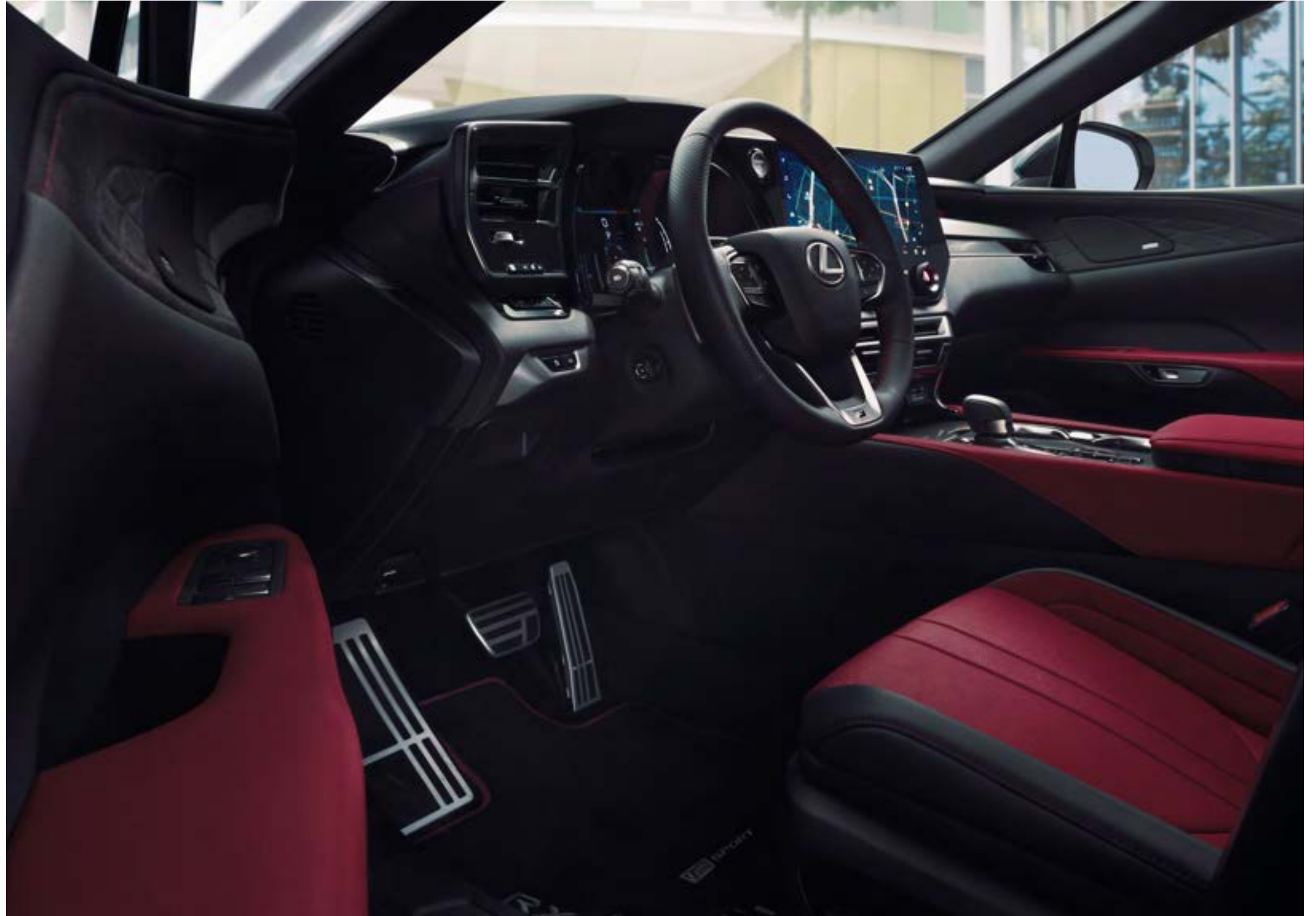
RX F SPORT Performance shown with Rioja Red leather and Dark Graphite Aluminum interior trim

Leave distractions behind. When crafting the interior of the all-new RX, Lexus designers focused on creating a space that was open and inviting, with easy access to the things a driver needs most. Front seats offer an ideal blend of comfort and support, and for the driver, an ergonomically shaped steering wheel and intuitive controls fall easily to hand. Seating position, and even the angle of the windshield, have been optimized to enhance outward visibility. And an elegantly concealed console storage area and available wireless charging tray 9 help provide easy access to all those important day-to-day items.