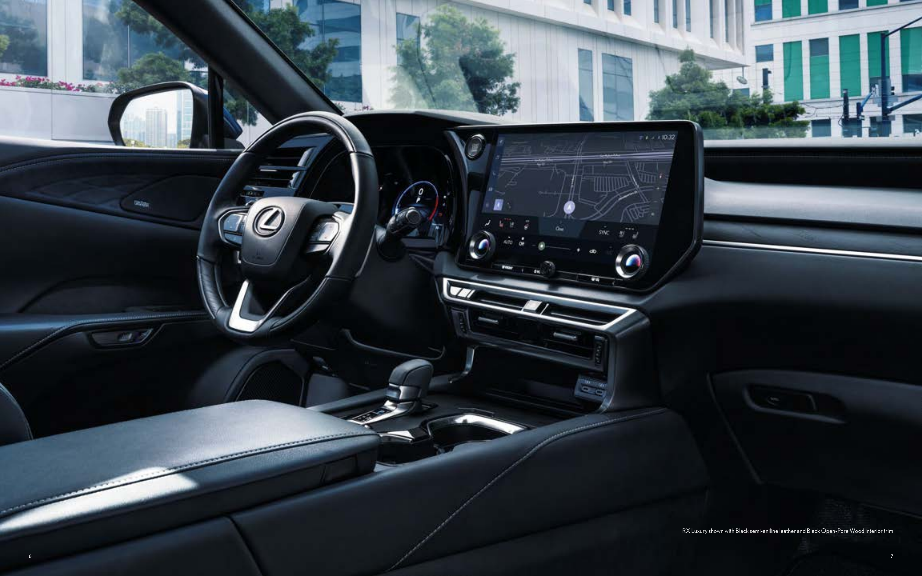
RX Luxury shown with Black semi-aniline leather and Black Open-Pore Wood interior trim