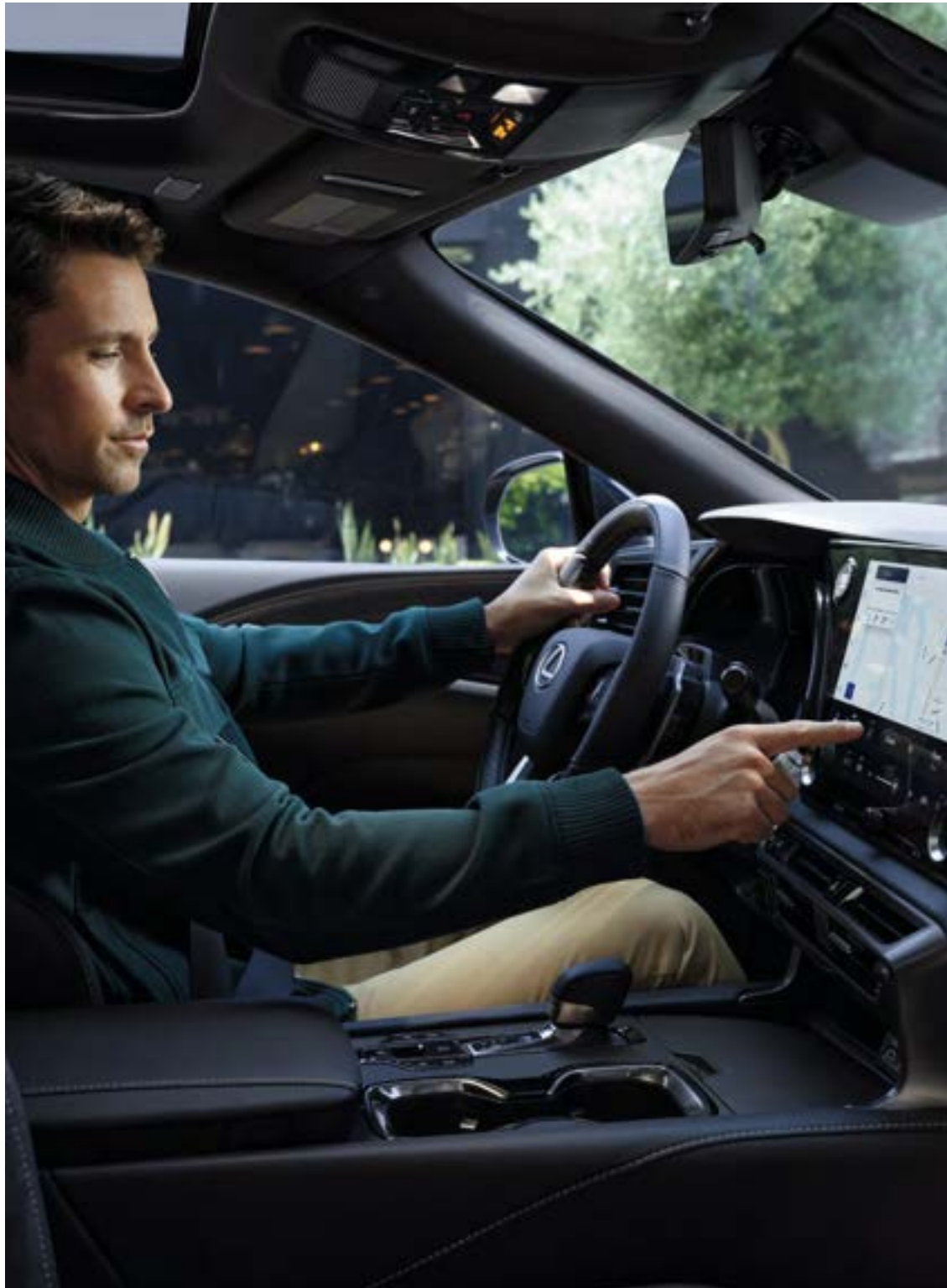
RX Luxury shown with Black semi-aniline leather and Black Open-Pore Wood interior trim