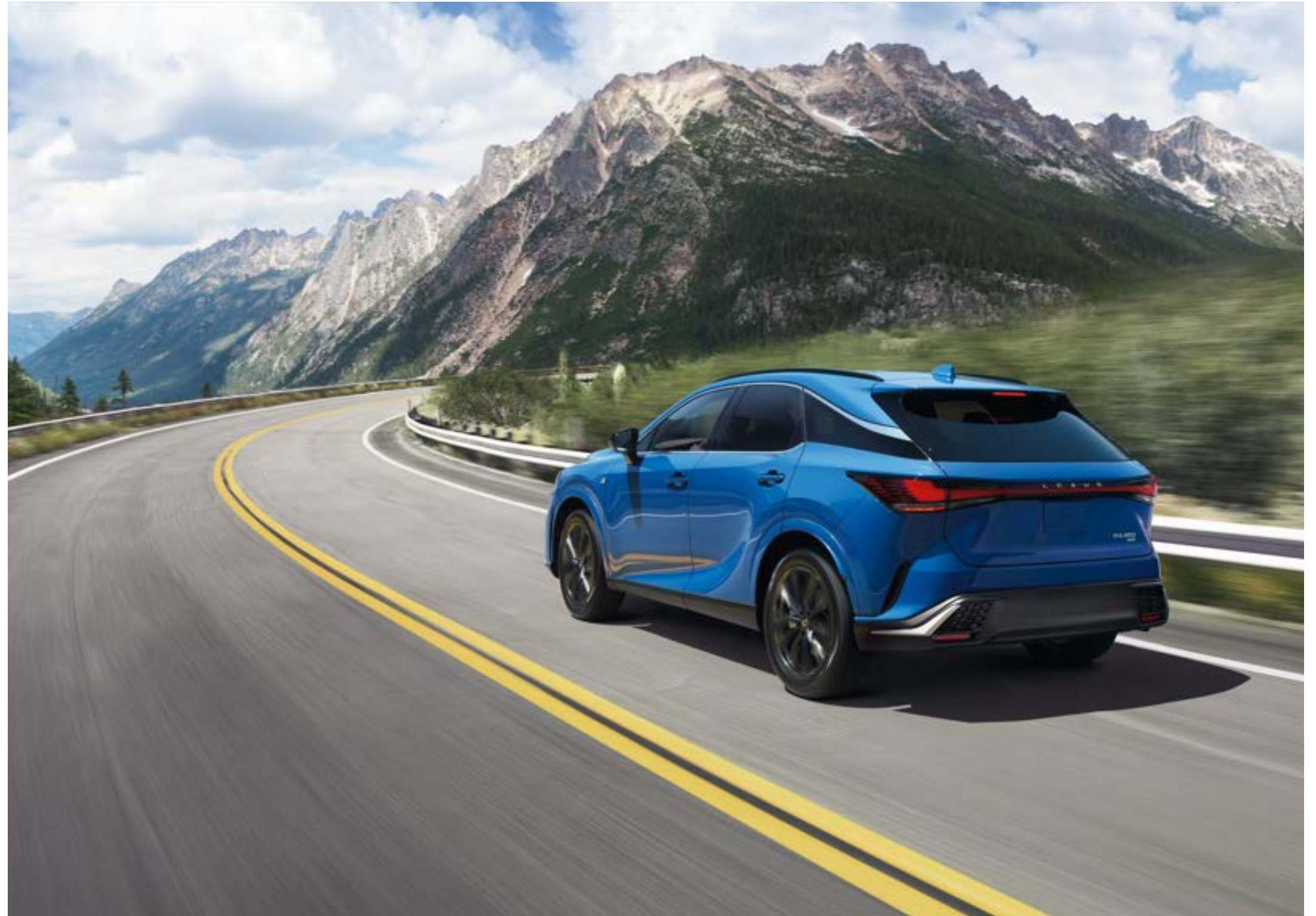
RX F SPORT Handling AWD shown in Grecian Water

To help provide the highest level of responsiveness, all F SPORT models offer selectable drive modes to help you finely tune your drive to suit your desires. Sport mode adjusts the Adaptive Variable Suspension, while Custom mode allows you to personalize everything from road feel to responsiveness. Further enhancing the excitement, an exclusive performance-inspired gauge cluster provides real-time information such as G-force metrics, power distribution and more.