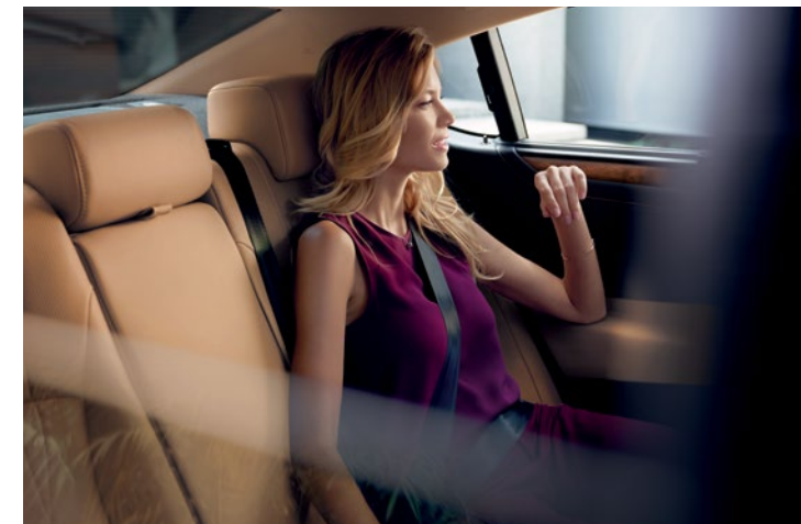
ESh shown with Apple CarPlay ® integration and Palomino semi-aniline leather interior trim

Featuring an all-new touchscreen, innovations like Apple CarPlay integration and Android Auto, and offering class-exclusive audio technology, 6 the ES helps keep you more connected than ever before.