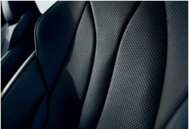
ES F SPORT shown with Circuit Red NuLuxe ®12 and Hadori Aluminum interior trim