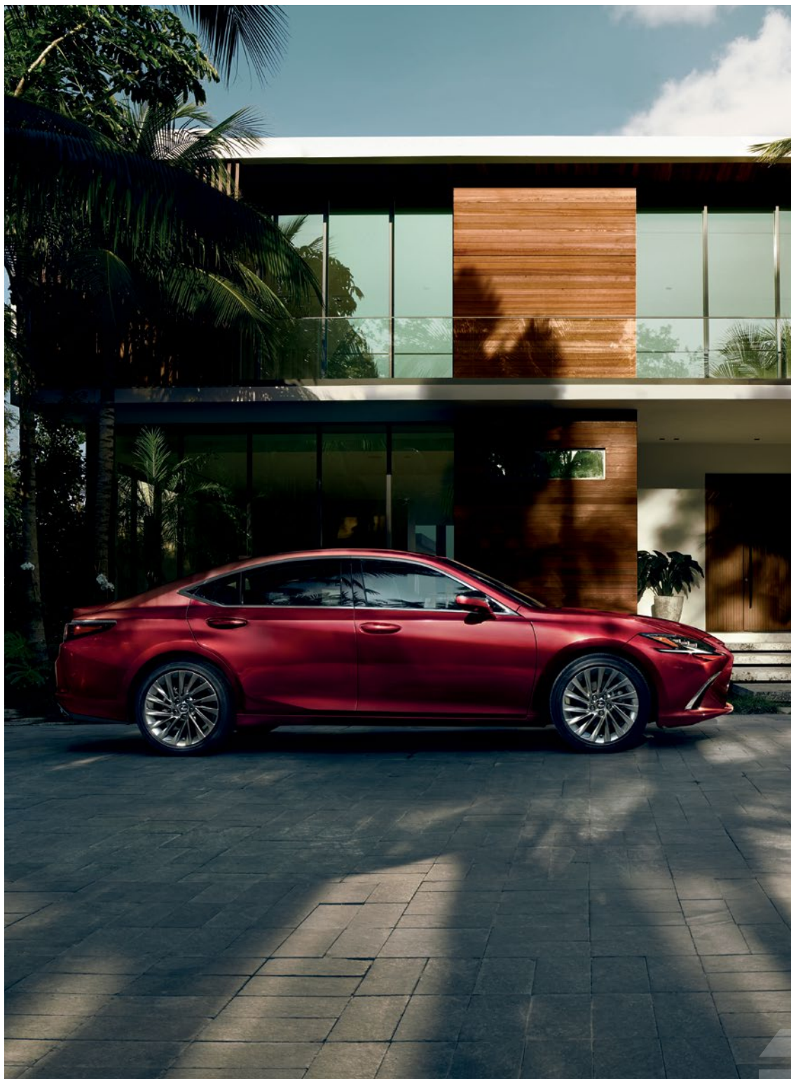
ES shown in Matador Red Mica