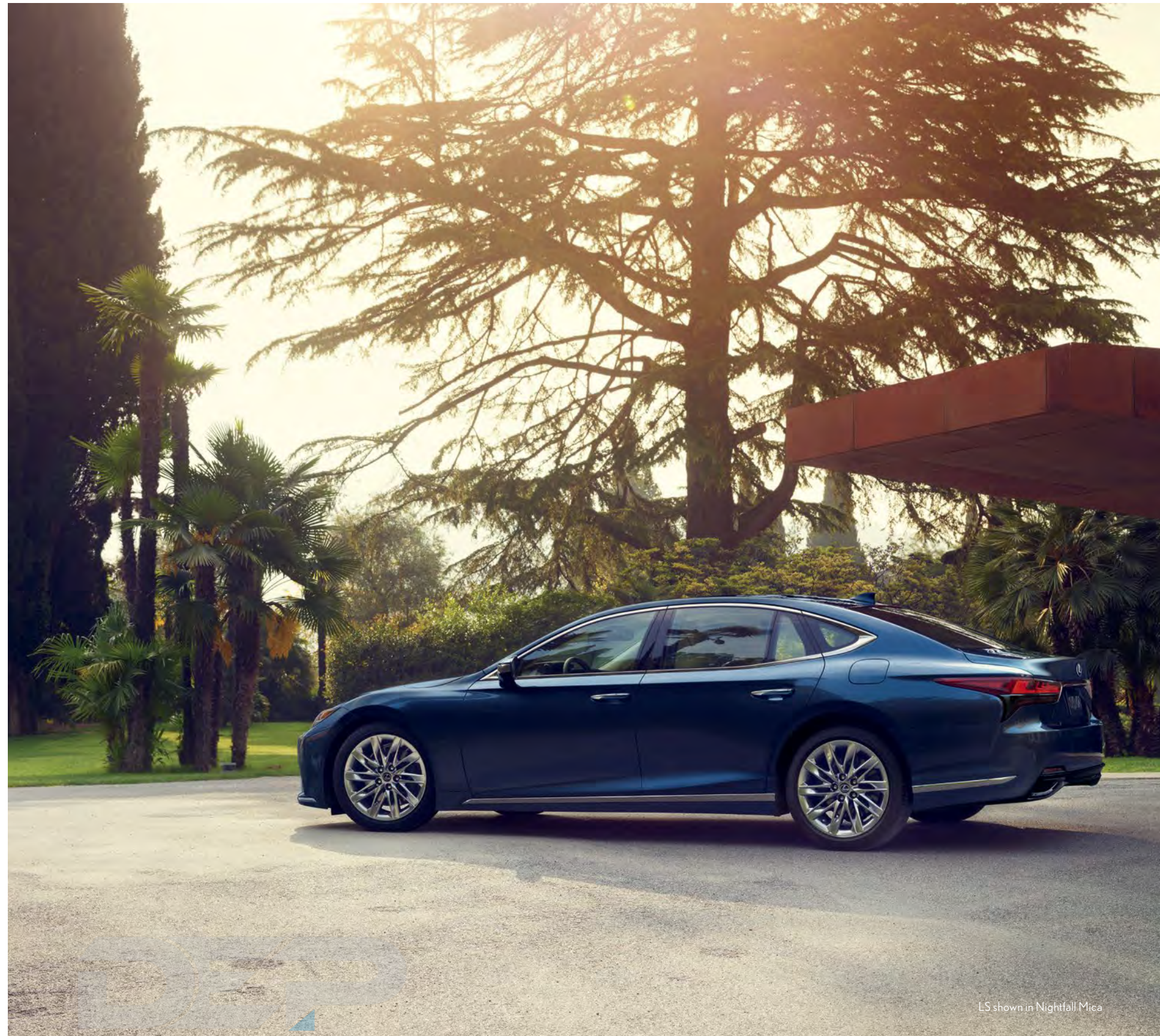
LS shown in Nightfall Mica

Split-five-spoke alloy wheels with Dark Vapor Chrome finish STANDARD LSFSPORT