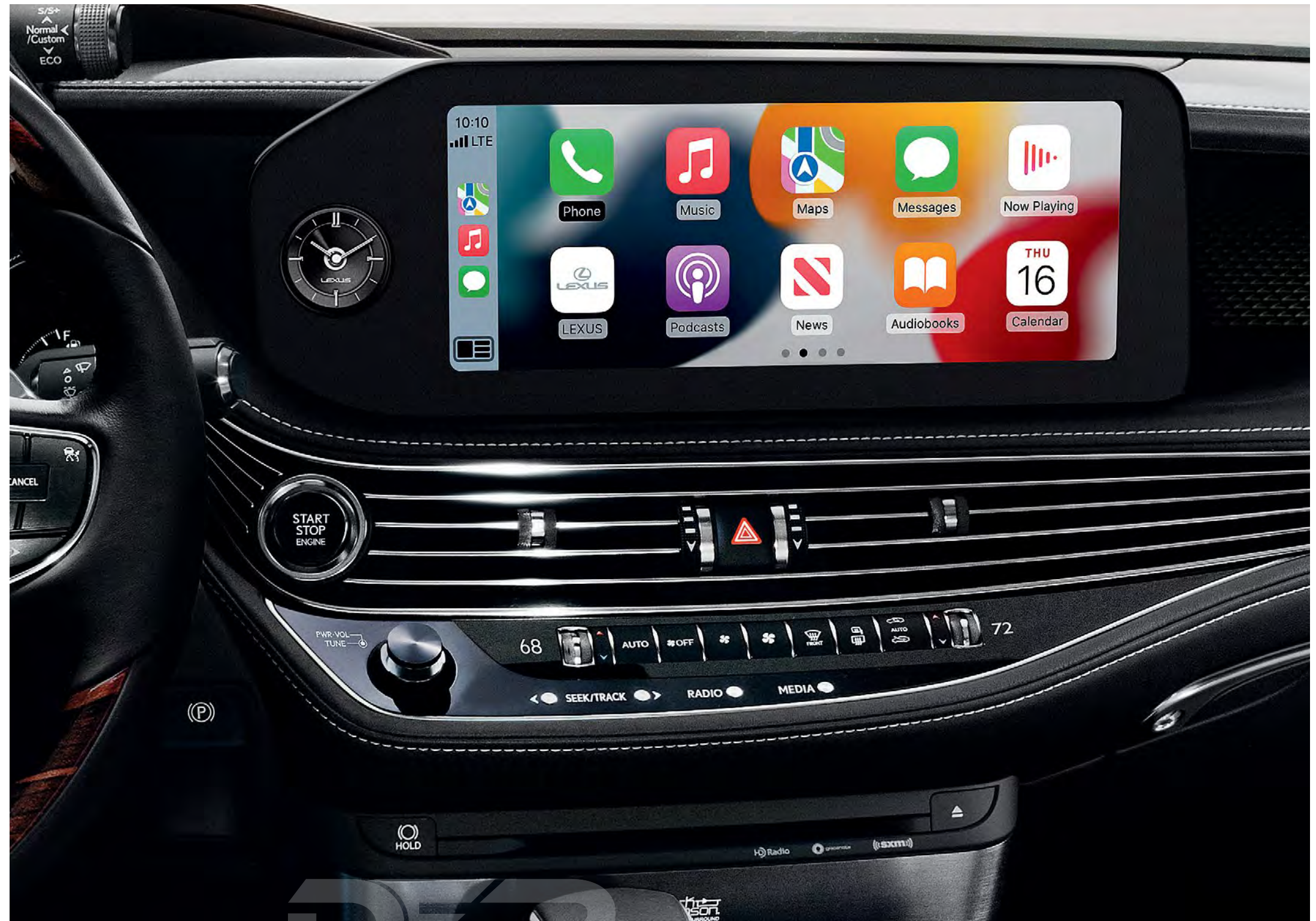
LS shown with Apple CarPlay integration and Black leather and Artwood Organic Gloss interior trim

To help you get the most out of these and other features in your new Lexus, a Vehicle Delivery Specialist will walk you through nearly every setting and function you desire. And to answer questions that arise after delivery, a Vehicle Technology Specialist can offer expert guidance in person or without you ever leaving the driveway via camera-enabled apps like FaceTime. ® Learn more about these complimentary services at lexus.com/specialists .