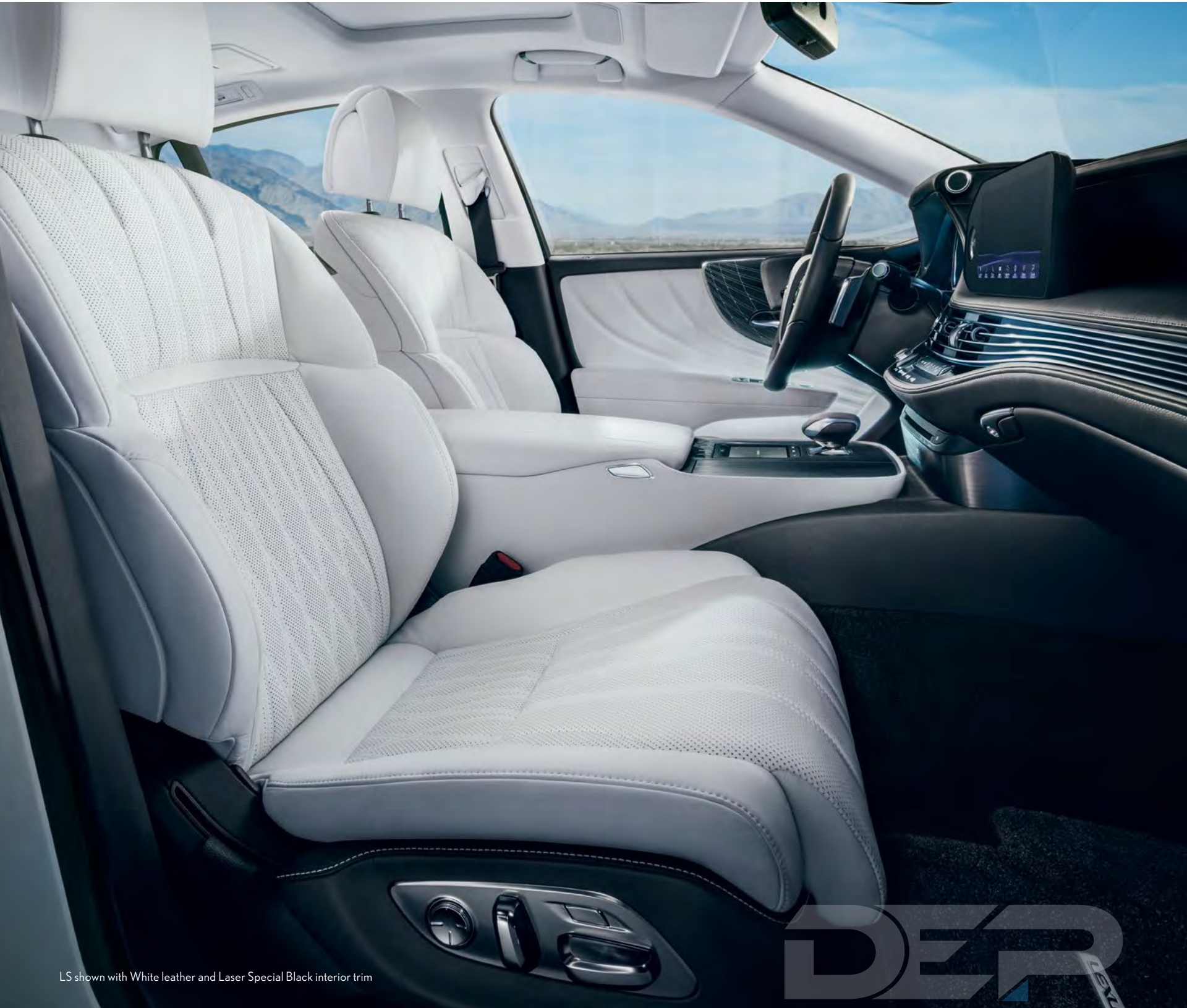
LS shown with White leather and Laser Special Black interior trim