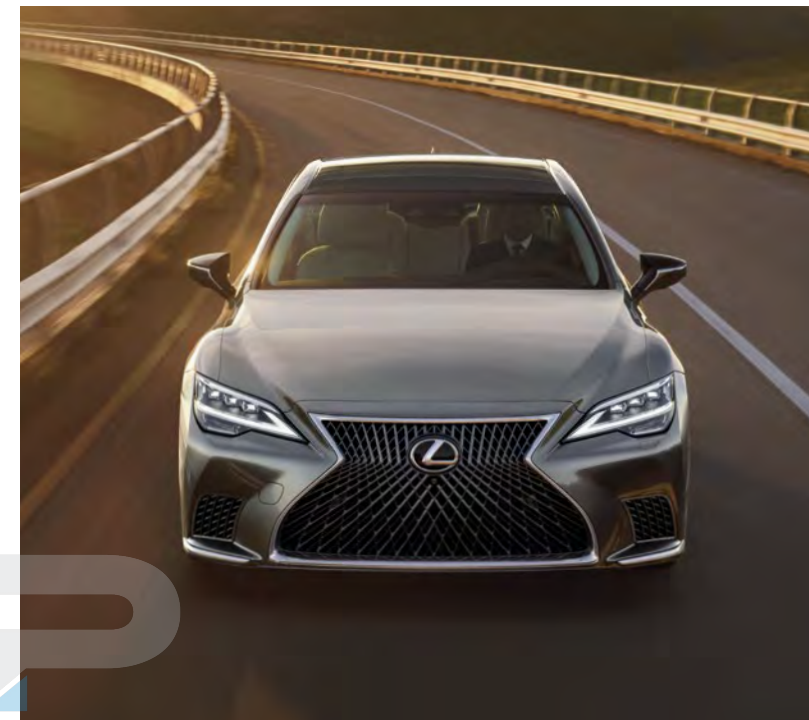
LS F SPORT shown in Ultra White 4

The seamless acceleration and all-wheel drive capability of the LS 500h AWD with Lexus Teammate. 2,3 The refined ride of the LS 500. The advanced vehicle dynamics of the daring LS F SPORT. The 2022 Lexus LS line evolves the definition of a Lexus flagship sedan. When it came to crafting the 2022 LS, no detail was overlooked. In addition to an enhanced available electronically controlled Adaptive Variable Air Suspension system, everything from the engine components to the composition of the tires was finessed to achieve further sound dampening within the cabin. The 2022 LS proves that only unconventional engineering can create unparalleled results.