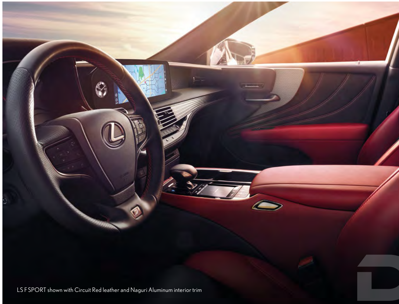
LS F SPORT shown with Circuit Red leather and Naguri Aluminum interior trim