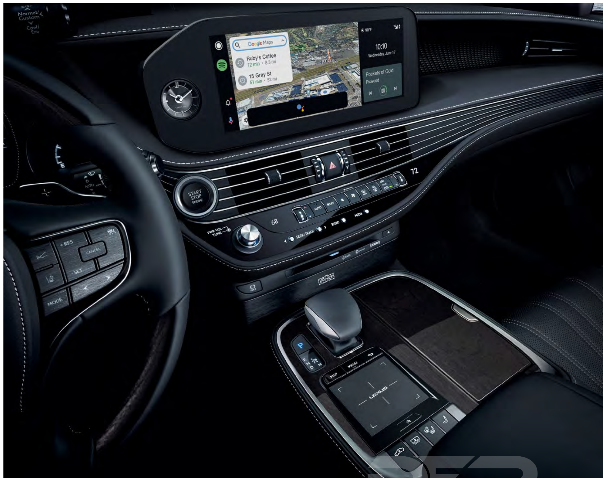
LS shown with Black leather, Gray Sapele wood, and Kiriko Glass interior trim