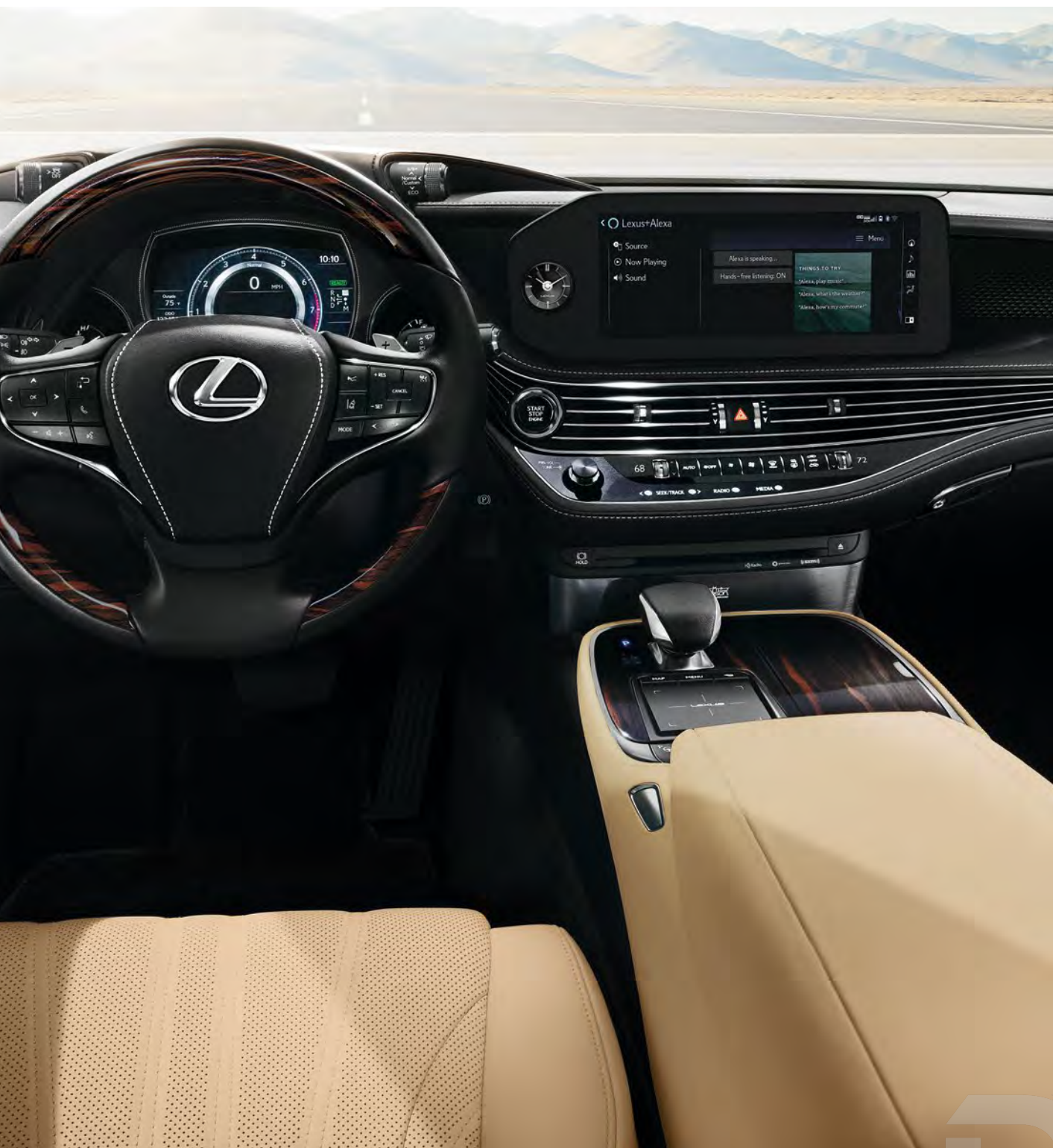
LS shown with Palomino leather and Artwood Organic Gloss interior trim