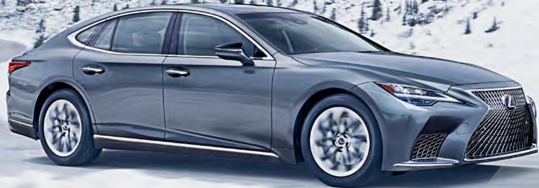
LS AWD shown in Manganese Luster 4

Never sacrifice style for capability with all-wheel drive, available on all LS models. Full-time all-wheel drive delivers engine power to all four wheels, and a Torsen ®31 limited-slip center differential efficiently distributes it between the front and rear axles, helping optimize traction, handling and control in a variety of driving conditions.