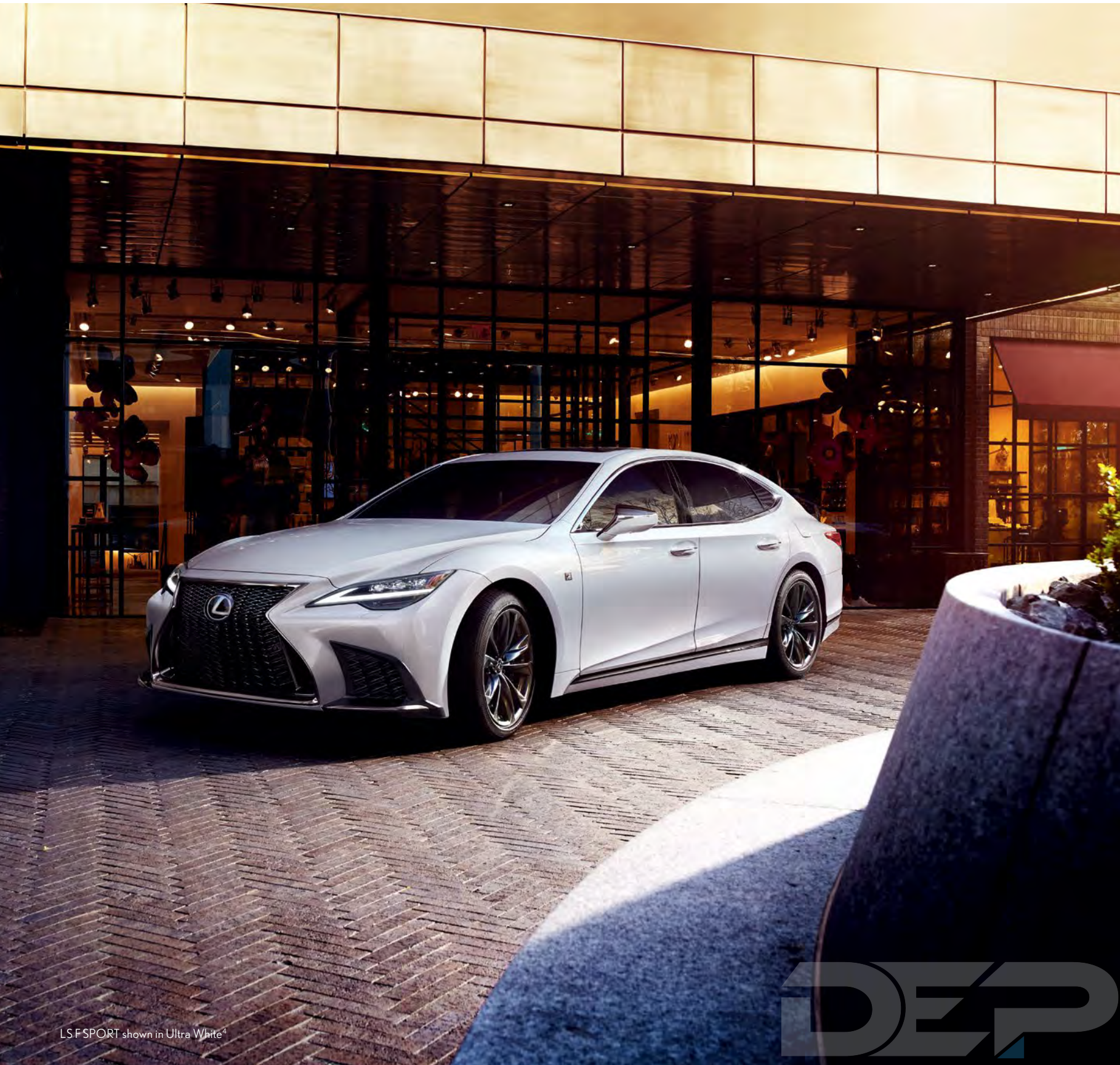
LS F SPORT shown in Ultra White 4