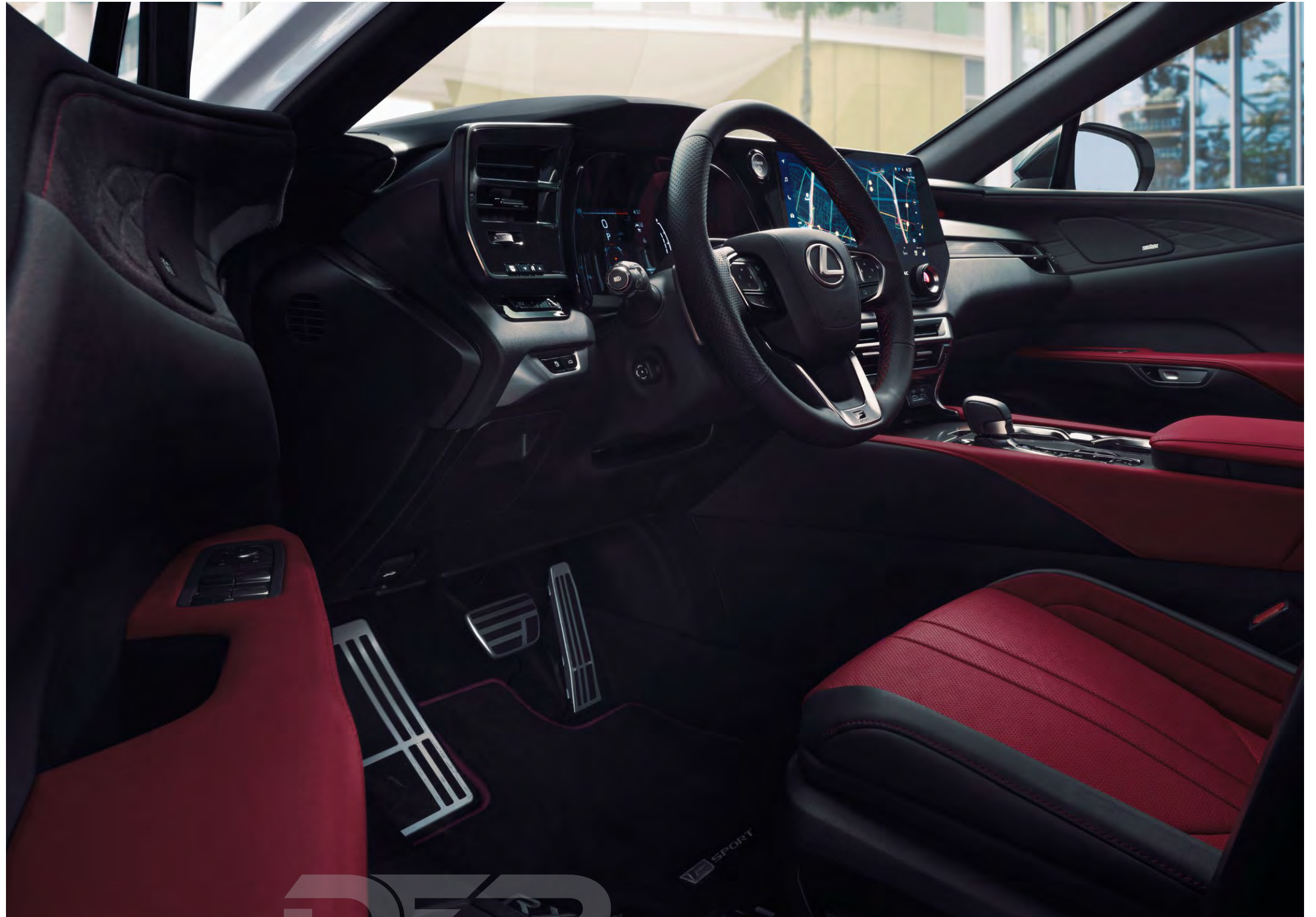
RX F SPORT Performance shown with Rioja Red leather and Dark Graphite Aluminum interior trim

Leave distractions behind. When crafting the interior of the all-new RX, Lexus designers focused on creating a space that was open and inviting, with easy access to the things a driver needs most. Front seats offer an ideal blend of comfort and support, and for the driver, an ergonomically shaped steering wheel and intuitive controls fall easily to hand. Seating position, and even the angle of the windshield, have been optimized to enhance outward visibility. And an elegantly concealed console storage area and available wireless charging tray 9 help provide easy access to all those important day-to-day items.