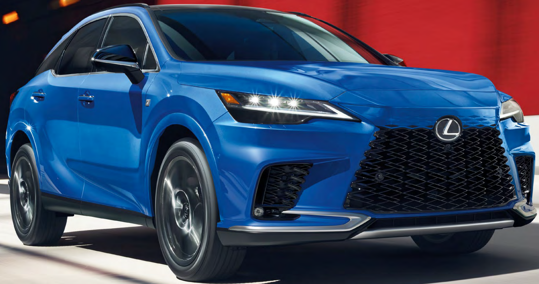
RX F SPORT Handling shown in Grecian Water