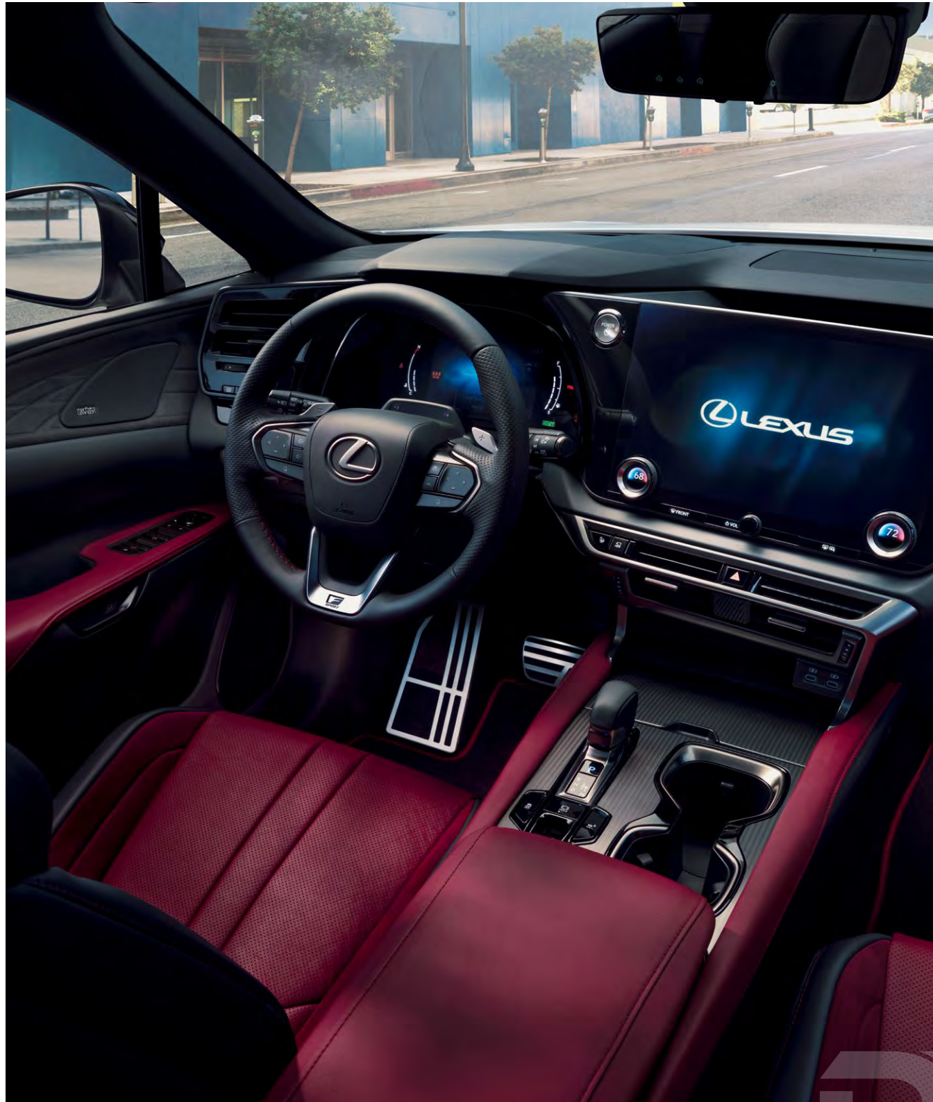
RX F SPORT Performance shown with Rioja Red leather and Dark Graphite Aluminum interior trim