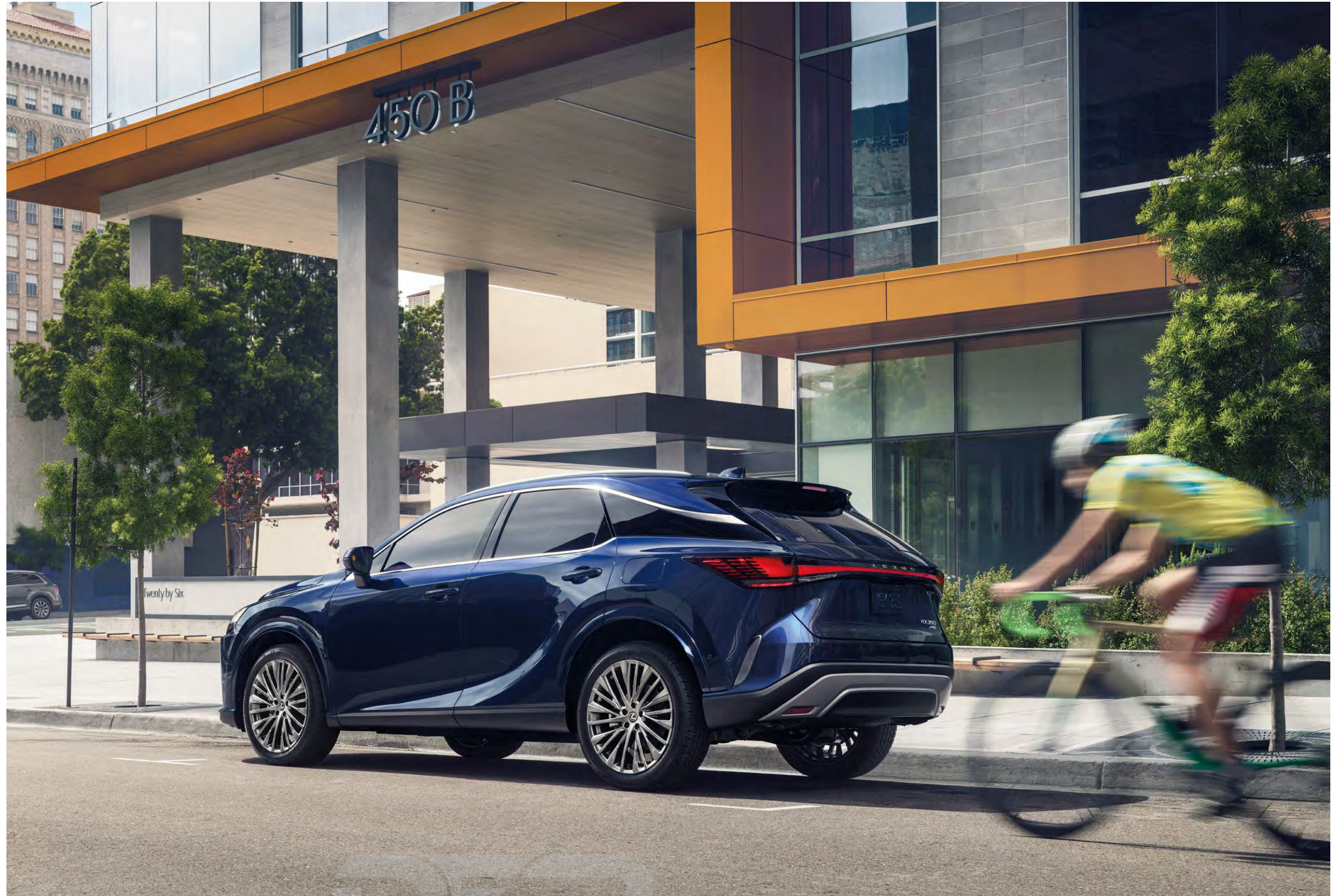
RX Luxury AWD shown in Nightfall Mica

Like cruise control for when highway traffic isn't cruising. With an active Drive Connect 3 trial or subscription, this available technology 19 can monitor surrounding traffic in condensed, low-speed driving situations and automatically move forward and brake as needed to keep a set following distance behind the preceding vehicle. In addition to providing hands-free steering assistance, this system can automatically bring the vehicle to a complete stop, then resume its path of travel as forward traffic begins to move.