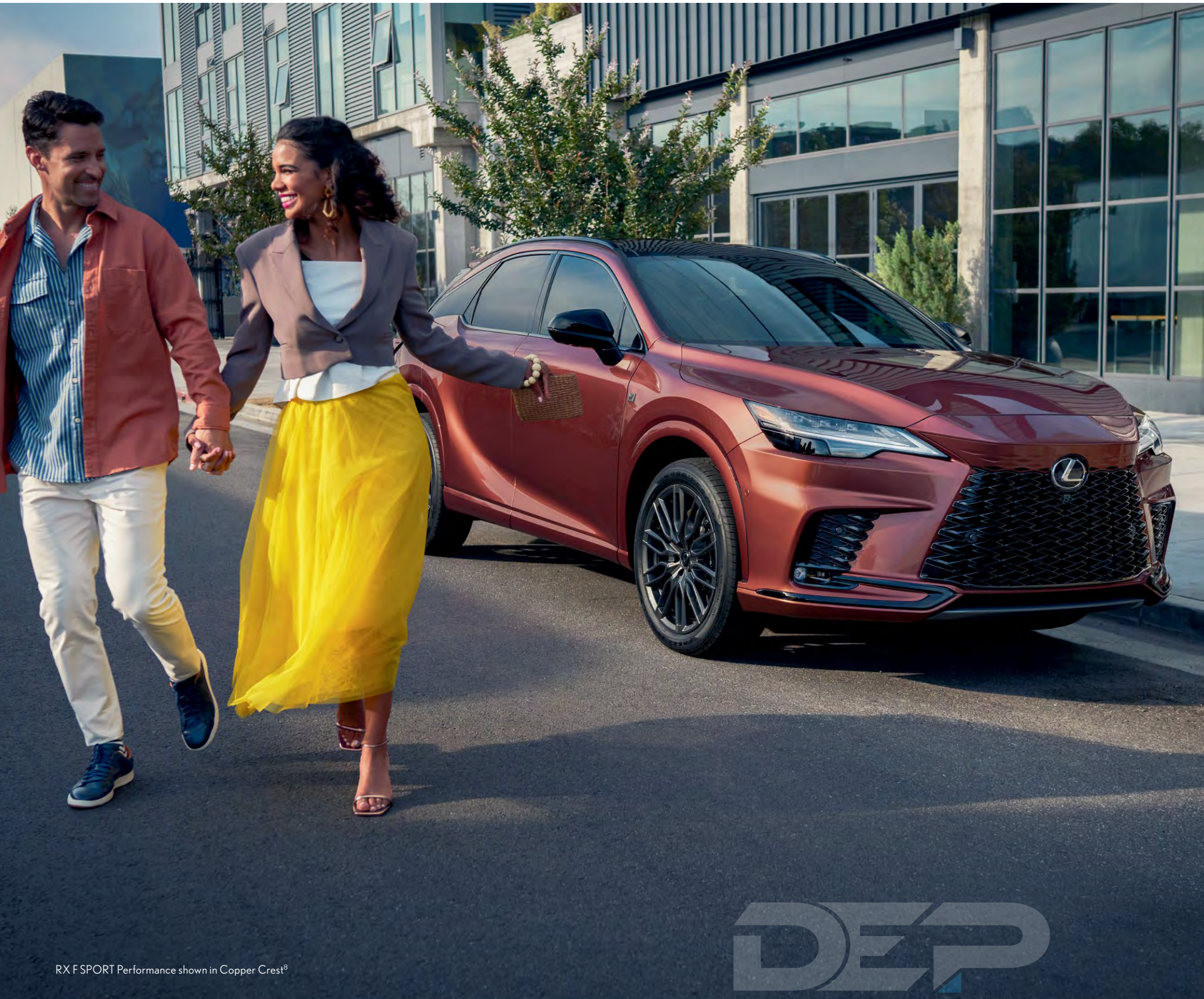
RX F SPORT Performance shown in Copper Crest®