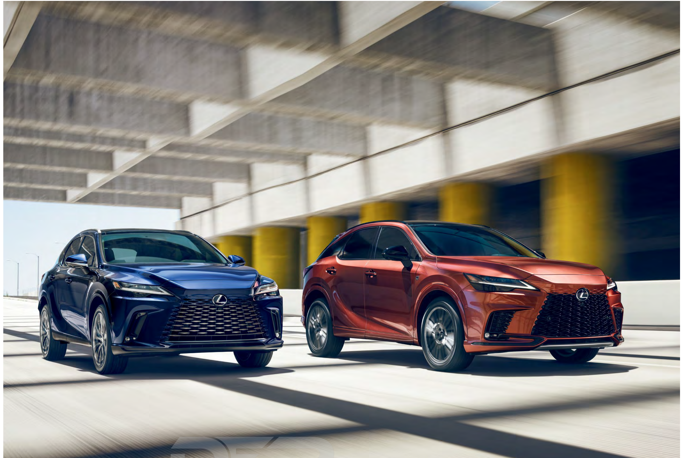
RX Hybrid Luxury shown in Nightfall Mica (left), RX F SPORT Performance shown in Copper Crest 8 (right)

For the greatest thrill ever offered in an RX, the all-new F SPORT Performance features an exclusive electrified powertrain. Featuring a 2.4-liter turbocharged gasoline engine, a high-output battery and two electric motors, it delivers 366 total system horsepower 6 and 406 lb-ft of torque. 1 It is tuned to deliver a drive unlike anything you've ever experienced and helps make the RX F SPORT Performance our fastest, most powerful RX ever.