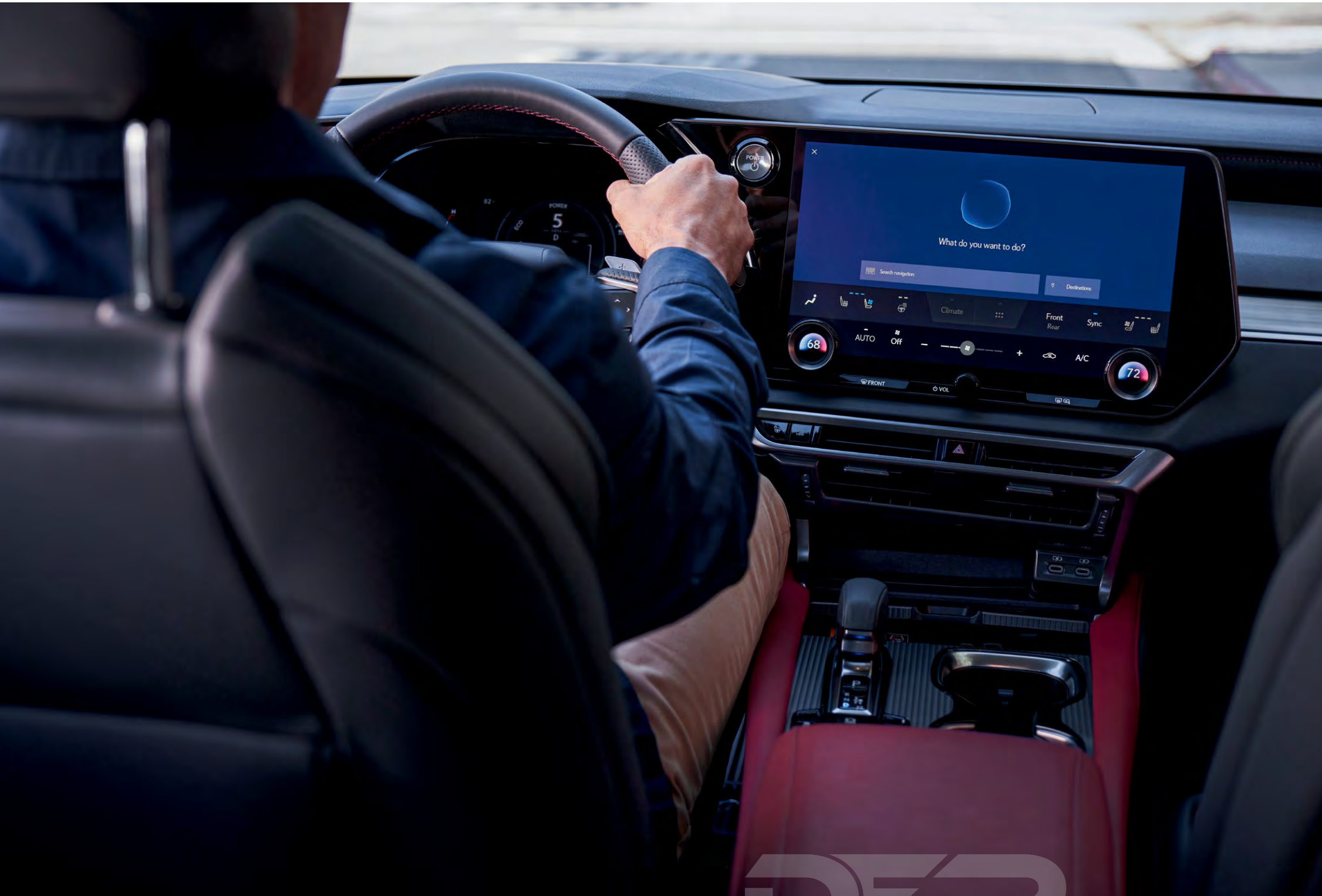
RX F SPORT Performance shown with 14-inch touchscreen display and Rioja Red leather and Dark Graphite Aluminum interior trim