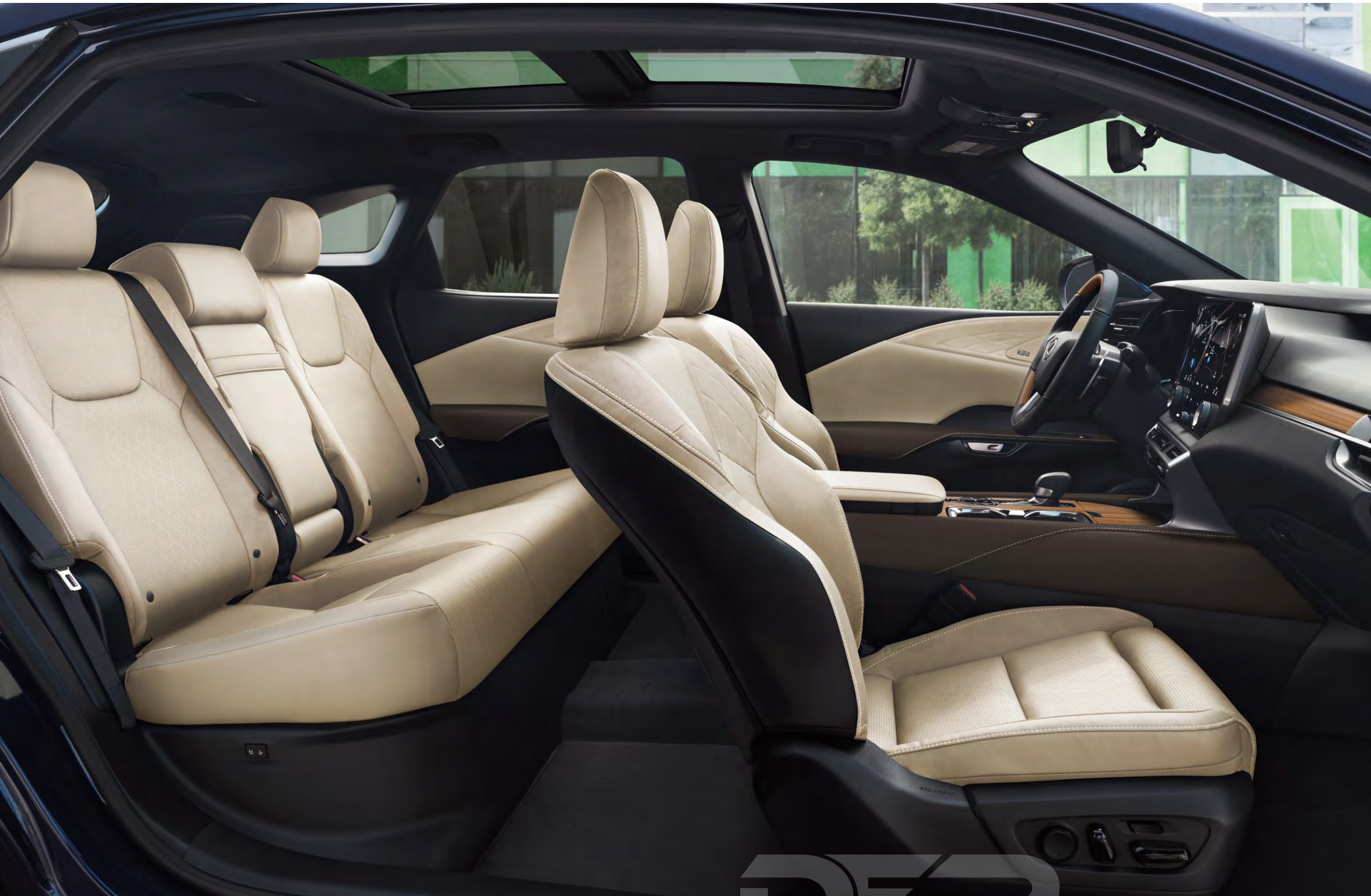
RX Luxury shown with Macadamia semi-aniline leather and Ash Bamboo interior trim