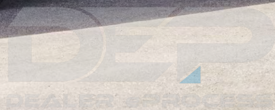
RX Luxury AWD shown in Nightfall Mica