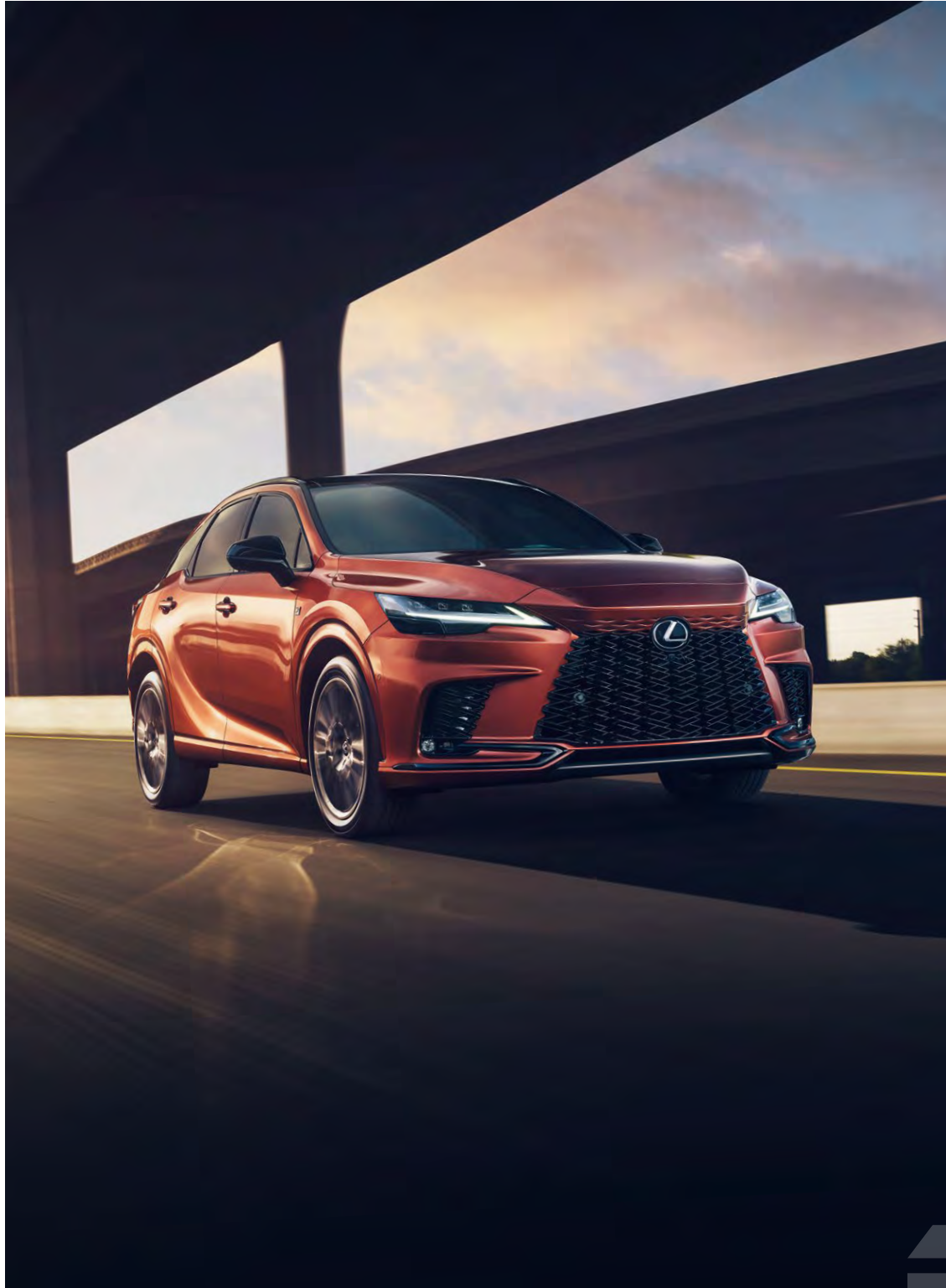
RX F SPORT Performance shown in Copper Crest ®