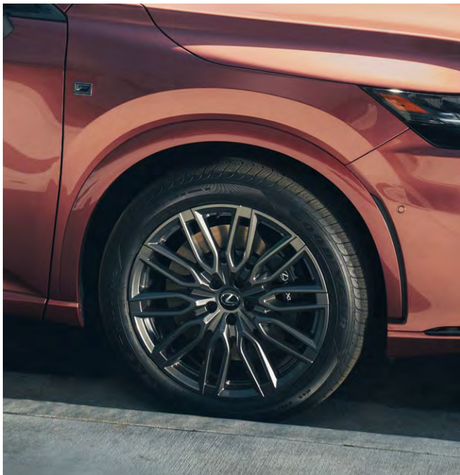
RX F SPORT Performance shown in Copper Crest®

For those who refuse to settle, this is the next generation of Lexus.